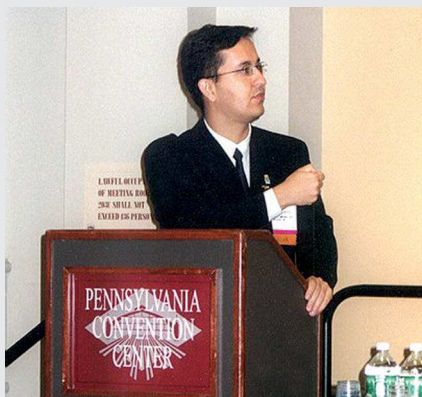
Balint Orban Memorial Competition, American Academy of Periodontology (AAP) - Pennsylvania.