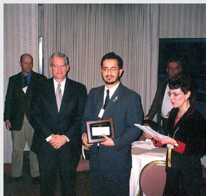
The Midwest Society of Periodontology - Chicago.