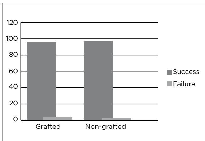
Figure 3 - Success rate of implants installed in areas submitted to bone graft.

implant is considered successful in the absence of mobility at the time of reopening and beginning of the prosthetic phase, absence of radiolucent radiographic image adjacent to the implant and when suppuration or symptomatology associated with the implant are not present. The potential risks of early failure include bone amount and quality, receptor site, presence of bone grafts, genetic predisposition, metabolic disorders, smoking habits, 4,21 implant biocompatibility and morphology, and surgical technique. 1,5 As for late failure, we can also add planning and development of the prosthetic phase. 13,18