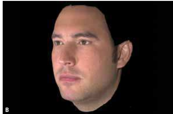
FIGURE 2 - A) Vectra-3D system, CanfieldScientific, Inc., Fairfield, NJ, USA. B) Facial image obtained with stereophotogrammetry system.