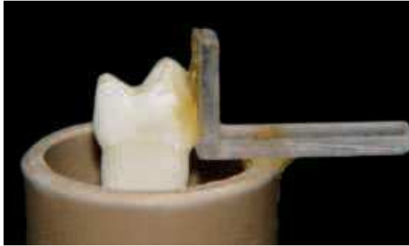
FIGURE 1 - Tooth-square set bonded to PVC tube with sticky wax.

made from two 2 mm thick acrylic sheets. Each acrylic sheet was 5 mm wide, one measuring 10 mm in length and one 20 mm. These sheets were glued with universal instant adhesive. Each tooth was attached to the acrylic square with sticky wax while keeping the buccal surface parallel to the surface of the square and the cemento-enamel junction was used as the lower limit. The tooth-square set was bonded with sticky wax to a PVC tube measuring 25 mm in diameter and 35 mm in height (Fig 1).