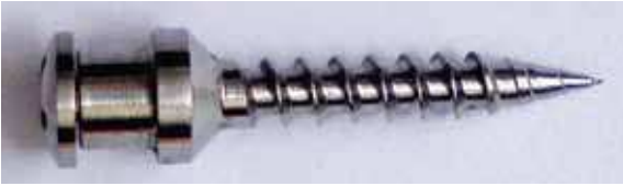
FIGURE 1 - Mini-implant prototype with screw, in lateral view.