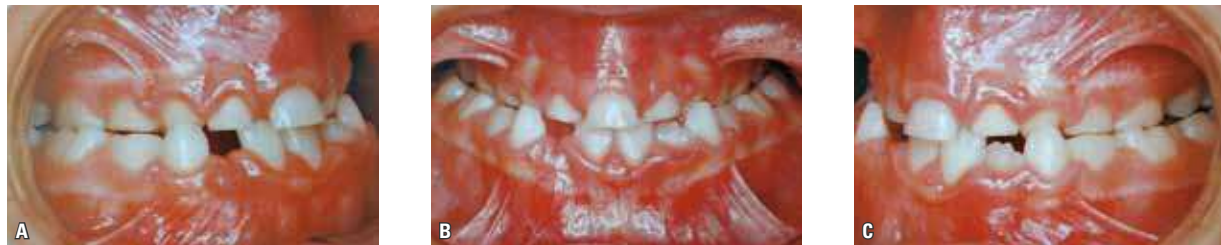
FIGURE 1 - A) Right lateral view of the clinical status at diagnosis. B) Initial clinical aspect of the case, with the presence of a solitary maxillary central incisor. C) Left lateral view of the clinical status at diagnosis.

Regarding the presence of systemic changes,