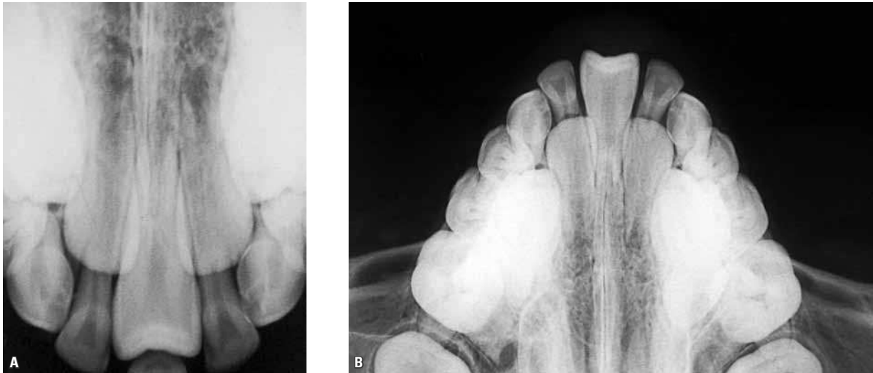
FIGURE 3 - A) Periapical radiograph, which confirms the presence of a solitary maxillary central incisor. B) Occlusal radiograph, confirming the presence of a solitary maxillary central incisor.

the patient's parent reported no involvement. This evaluation is important, since SMMCI may be associated with other developmental problems such as congenital nasal abnormalities, 1,4,11,15,16,17 growth deficiencies, 8,22 holoprosencephaly, 6,28 format changes and craniofacial morphology, 25 congenital heart disease, 8,10 among other local and systemic changes. However, there are studies that found no relationship between SMMCI and systemic changes. 5,27