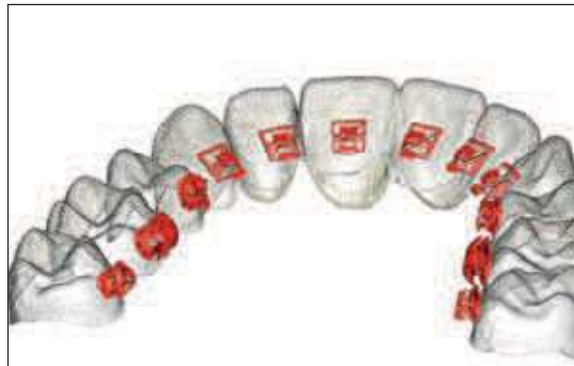
FIGURE 4 - Positioning brackets on virtual set-up.