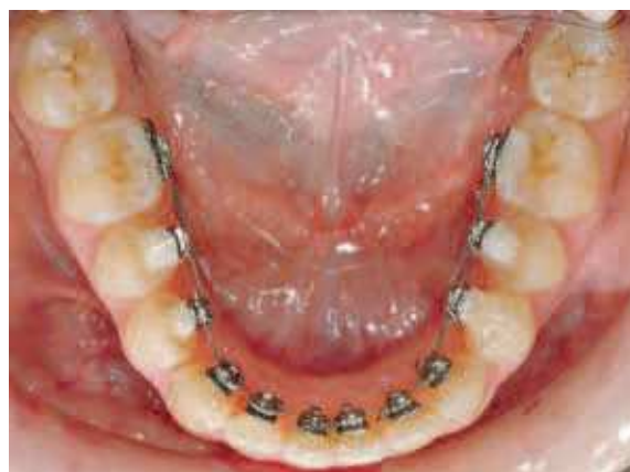
FIGURE 1 - Straight Wire lingual appliance.

To ensure patient comfort brackets should be small, with a maximum of 2 mm thickness. You don't need hooks on all teeth, only canines