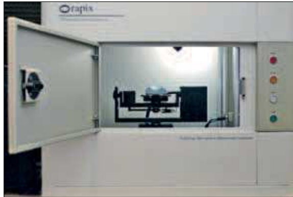
FIGURE 2 - Three-dimensional scanner.