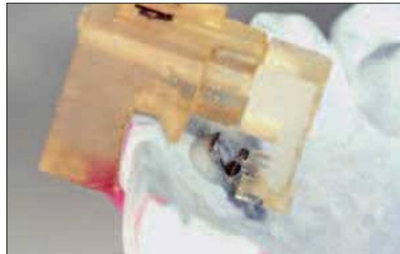
FIGURE 5 - Transfer jig on malocclusion model.

Figure 4 shows the placement of brackets on the virtual set-up and Figure 5 shows the transfer jig mounted on the malocclusion model, ready for bracket transfer to the patient's mouth.