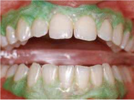
FIGURE 4 - Protective resin dam applied to cervical region; it drastically reduces or prevents contact of whitening product with gingival mucosa and cemento-enamel junction.

cer promoting effects of tooth whitening products: Are the risks greater when tooth whitening is applied at home and prepared by the patient with or without professional supervision?