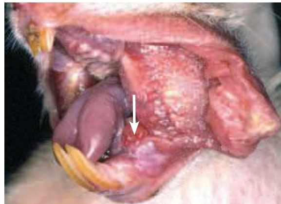
FIGURE 2 - DMBA-induced squamous cell carcinoma in lateral tongue margin and floor of the mouth of golden Syrian hamster after drug application on alternate days for 22 weeks.