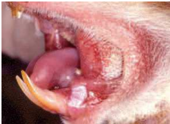
FIGURE 1 - Normal lateral tongue margin and mouth floor in golden Syrian hamsters.

Using the same experimental model, Camargo 5 was mentored, as part of a PhD Program, to test once more the carcinogenic effect of 27% hydrogen peroxide and a specific whitening product containing 10% carbamide peroxide. At the same time, the effects of toothpastes with hydrogen peroxide in their composition were investigated.