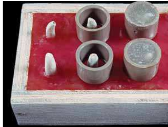
FIGURE 1 - Steps taken to insert bovine teeth in PVC tube.

In the groups using Transbond XT, bonding was light cured for 40 seconds, i.e., 10 seconds on