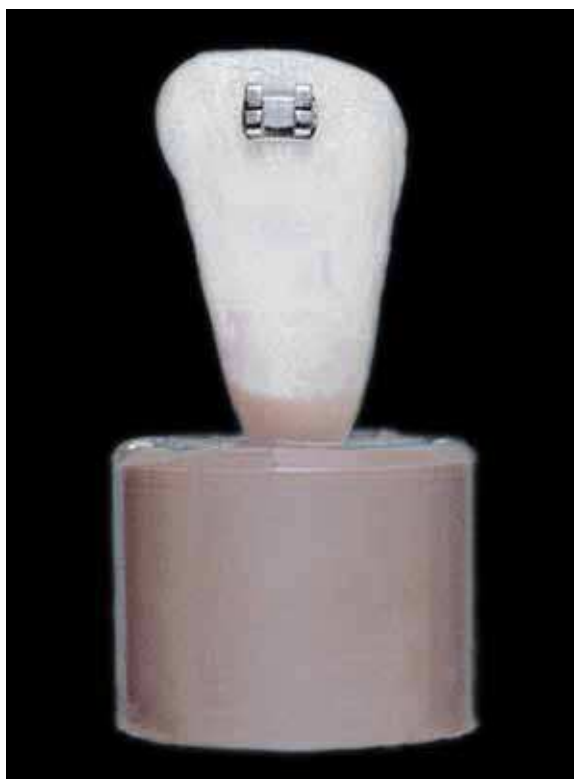
FIGURE 5 - Specimen with bracket bonded to buccal surface.

In the groups using Concise composite no light curing was performed as this is a self-curing material.