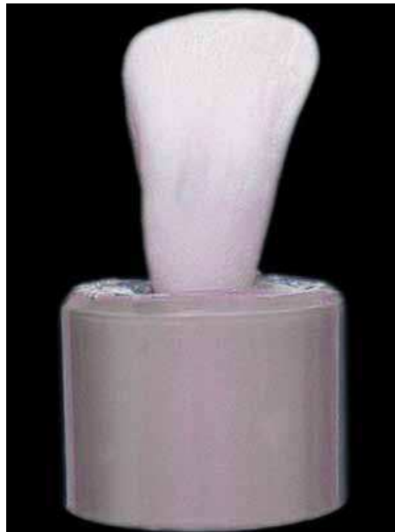
FIGURE 2 - Bovine tooth inserted in PVC tube.

each surface (mesial, distal, incisal and gingival) as close as possible to the base of the bracket with a halogen light unit XL 2500 (3M/ESPE, St. Paul, USA) with 500 mW/cm 2 power. This light intensity was verified prior to each light curing session with a radiometer (Demetron, Danbury, USA).