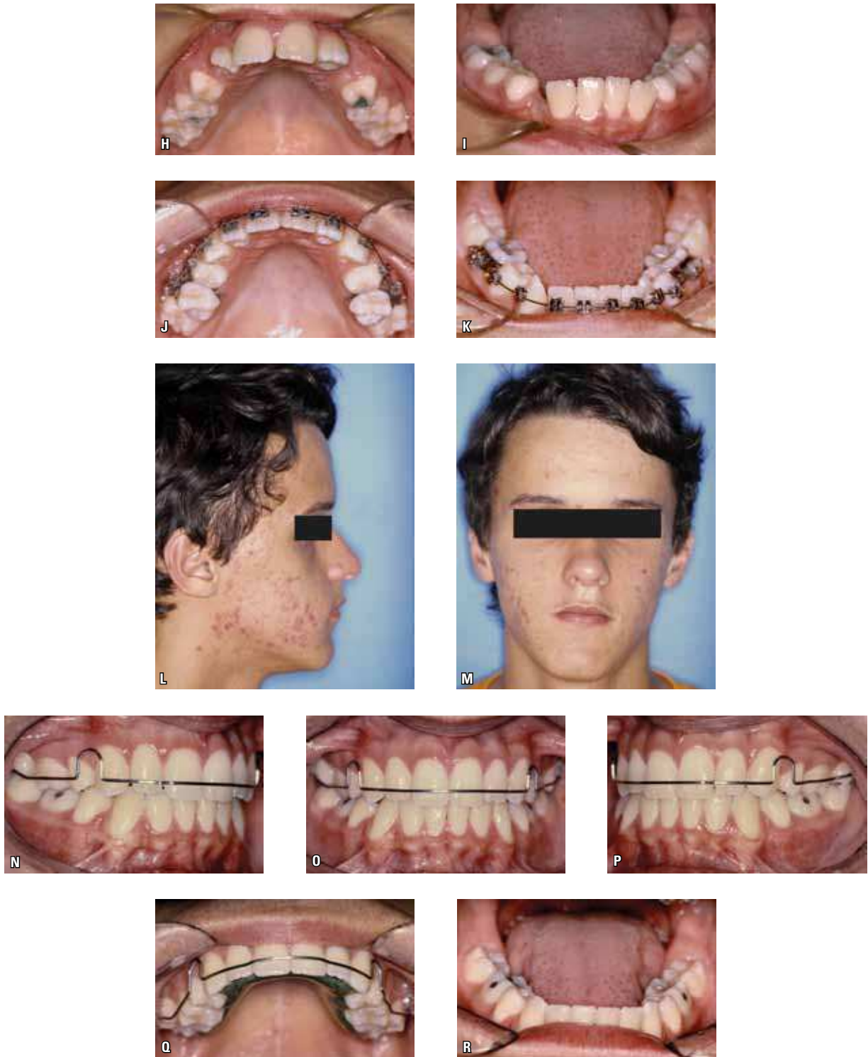
FIGURE 1 - Patient treated with serial extraction orthodontic mechanics. First phase of serial extraction involved extraction of deciduous canines in the first transitory period of mixed dentition. Second phase involved extraction of first premolars in second transitory period. A) Profile initial photograph. B) Frontal initial photograph. C, D, E) Intraoral initial photographs. F, G) Occlusal initial views. H, I) Occlusal views after deciduous canines extraction. J, K) First premolars extracted and fixed orthodontic treatment. L) Final profile photograph. M) Final frontal photograph. N, O, P) Final intraoral photographs with Hawley retainer. Q, R) Occlusal final views.