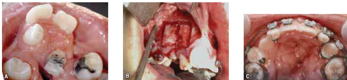
FIGURE 4 - Pre-corticotomy (A), reshaping of dental arch with buccal corticotomies (B), post-corticotomy (C).