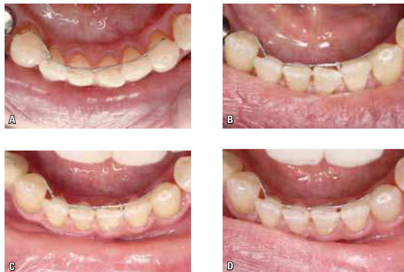
FIGURE 2 - Lower right incisor rotation after bonded retainer failure (A). The solid thread was stretched and bonded with composite just on the distal surface (B). After 10 days, a significant improvement was observed and a new thread was inserted (C). After 20 days the case was finished and the tooth was rebonded to the lower retainer (D).