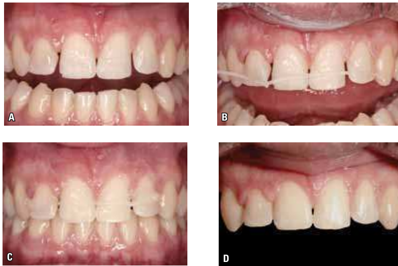
FIGURE 3 - Reopening space at the mesial of the upper lateral incisors after maxillary retainer bonding fracture (A). The retainer was still bonded to the upper canines and upper central incisors. A knot was made at the end of the solid thread (B) and this knot was bonded with composite to the labial surface of the upper left lateral incisor. The elastomeric thread was pulled and bonded to the upper right lateral incisor. The space was closed in just 10 days and the upper lateral incisors were rebonded to the upper retainer.