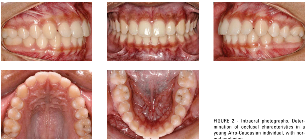
FIGURE 2 - Intraoral photographs. Determination of occlusal characteristics in a young Afro-Caucasian individual, with normal occlusion.