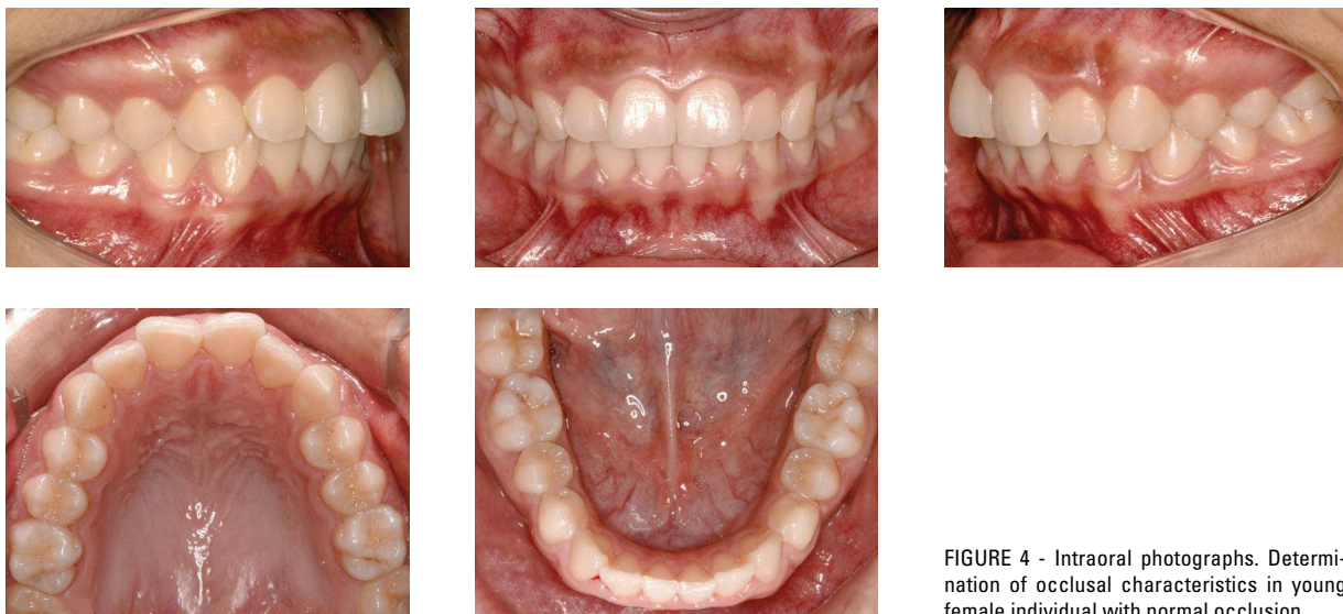
FIGURE 4 - Intraoral photographs. Determination of occlusal characteristics in young female individual with normal occlusion.