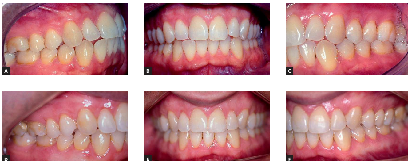
Figure 1 - Patient presenting a Bolton discrepancy with anterior excess. Treatment performed with extraction of only a lower permanent incisor.