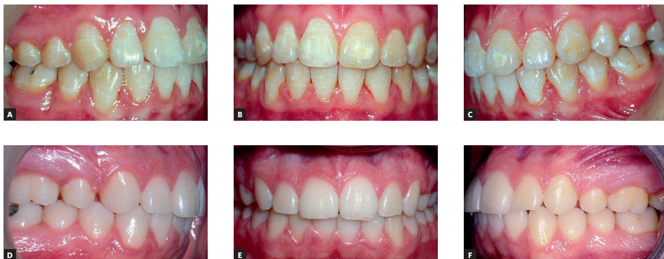
Figure 3 - A, B, C) Finalization with first permanent molars in Class III relationship. D, E, F) Finalization with first permanent molars in Class II relationship.