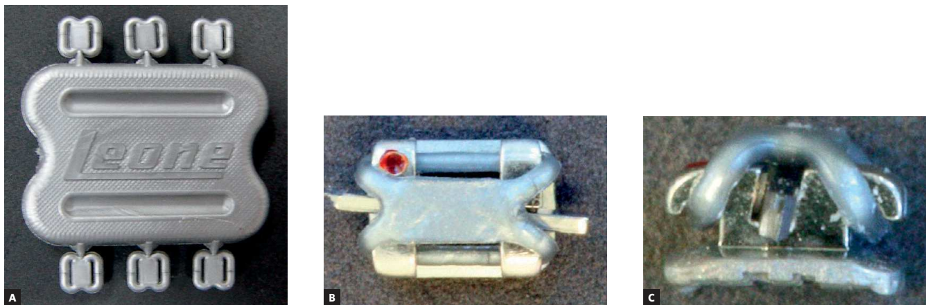
Figure 3 - A) Slide® elastic ligature, B) Frontal view of the ligature tied to a conventional metal bracket, C) Lateral view of this low-friction system, where there is no pressure on the orthodontic wire.

of the orthodontic treatment to increase efficiency in different clinical situations.