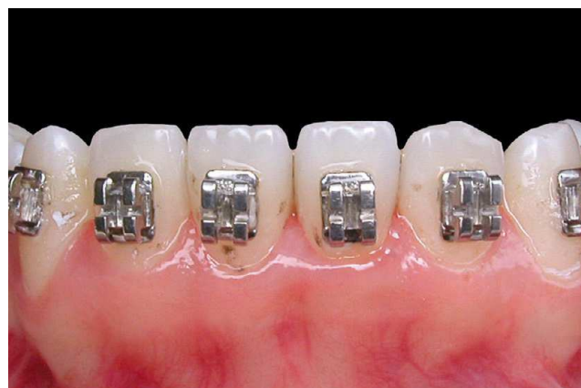
Figure 2 - One month after the surgical procedure.

The results showed that the laser treatment resulted in a statistically significant ( p < 0.001 ) increase in the distance of papilla to the incisal edge of the teeth and this was kept throughout the experimental period of two months. It can be concluded that the use of the \text{CO}_2 laser was effective on the removal of gingival hyperplasia in orthodontic patients.