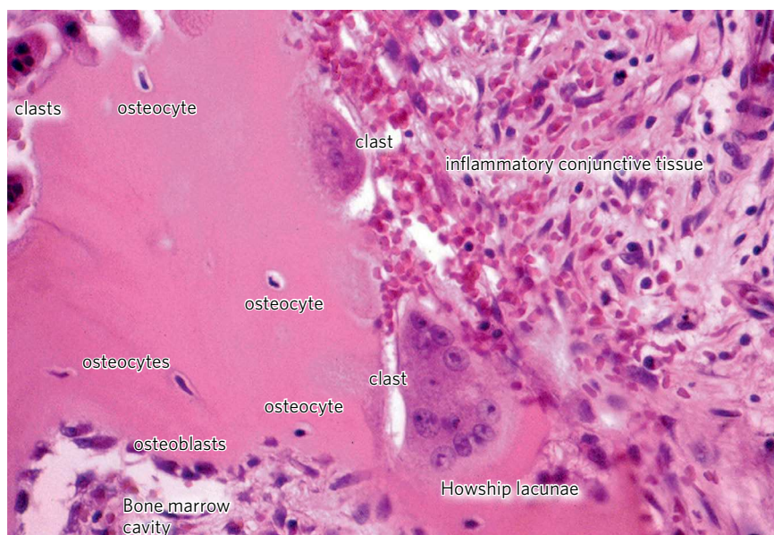
Figure 1 - The osteocyte network participates of the cellular functional control on bone surface, such as the clasts and osteoblasts. The cytoplasmatic prolongations arrive at the canaliculi and make contact with the surface cells or act via mediators (HE; 40X).

The skeleton is able to continuously adapt to mechanical loads by the addition of new bone to increase the ability to resist or remove bone in response to a lighter load or lack of use. 6,8 The osteocytes have a high interconnectivity and are considered the bone mechanotransducers.