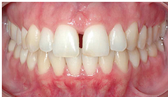
Figure 1 - Example of anterior superior diastema relapse. Photograph obtained 10 years after removing the superior Hawley retainer.

Ninety panoramic radiographs of 30 subjects (13 male and 17 female) taken at pre-treatment ( T_1 ), post-treatment ( T_2 ) and post-retention ( T_3 ) stages