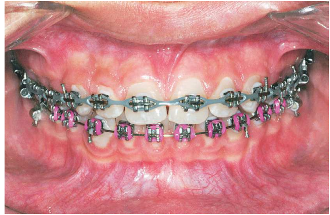
Figure 4 - Effect of crown mesialization induced by elastomeric chain.

Diastema relapse is quite often on maxillary anterior area. 10,24,26,27 Some authors reported that space reopening might be associated with an inappropriate root positioning at the end of treatment. However our results showed no difference between stable and unstable groups in central and lateral incisor angulations when compared in each initial, final, post-retention stages. In conclusion, this demonstrates that no association between space reopening and mesiodistal angulations was found.