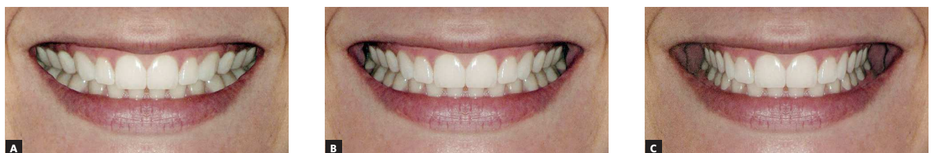
Figure 2 - Images of Caucasian woman's smile in close-up view of the mouth, showing narrow (A), medium width (B) and wide (C) buccal corridors.