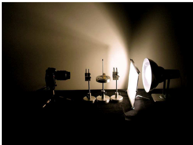
Figure 1 - Circular polariscope.

The fringe orders were verified around the canine, considering the sequence of colors produced in photoelastic material submitted to the increasing application of load and observation in the dark-field white-light polariscope (Table 1). 12 It is possible to observe that values of