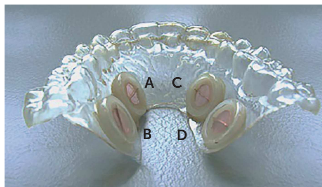
Figure 2 - Vacuum-formed maxillary splint with four incorporated resin discs, each of them containing two specimens.

Removable orthodontic appliances made of self-curing acrylic resin are key to the orthodontist armamentarium. They provide several possibilities of usage which range from minor tooth movement to retention after treatment with fixed orthodontic appliances. Nevertheless, there still is considerable doubt about the hygiene of such devices. Some orthodontists suggest that patients clean them with tooth paste or mild soap. In this context, effervescent tablets have been recently available on the oral hygiene market with promises of cleaning removable prostheses and/or orthodontic splints. However, would tablets clean orthodontic appliances effectively? With a view to answering this question, German researchers conducted an in vivo study. 5 To this end, a group of volunteers wore vacuum-formed maxillary splints with incorporated acrylic resin discs (Fig 2).