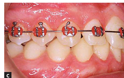
Figure 2 - Control side: intraoral photographs at T_0 (A), T_{14} (B) and T_{56} (C).