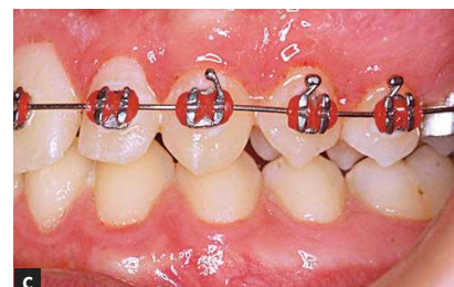
Figure 3 - Treatment side: intraoral photographs at T_0 (A), T_{14} (B) and T_{56} (C).