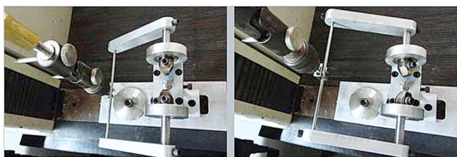
Figure 2 - Torsion device.

The movement (ascent) of the tailstock of the universal testing machine was transmitted to the torsion device by an articulated rod under 0.25 rpm (Fig 2).