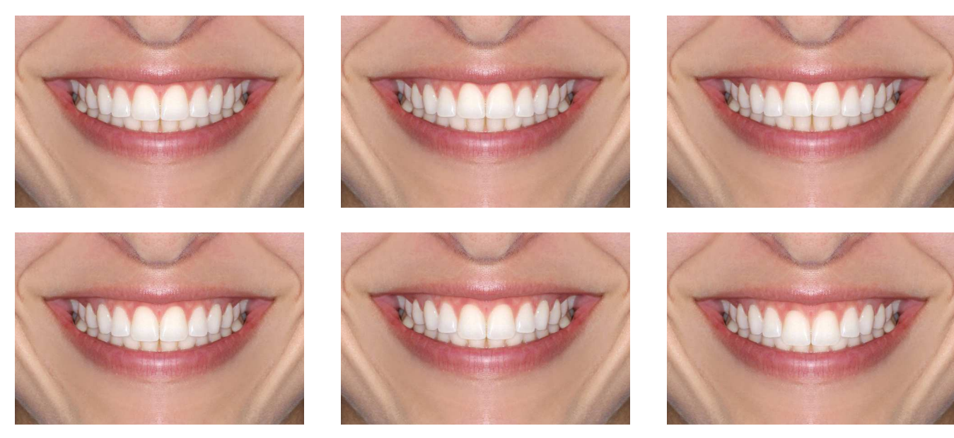
Figure 3 - White woman close-up smile view in 0.5-mm altered vertical positions increments.