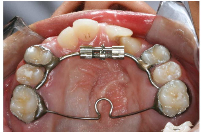
Figure 2 - Inverted mini-Hyrax expander.

The IMHX presented a jackscrew (Variety Expander, Dentaurem, Saint Ann, MO, USA) in the anterior region with arms that were bent posteriorly and soldered bilaterally to the first premolar bands. The extensions from the expander screw followed the palatal surface of the crowns of the first and second premolars and/or the first and second deciduous molars. A fixed transpalatal arch was connected the maxillary first molars to prevent posterior expansion, and stainless steel rods were welded on prior to appliance insertion to incorporate the canines into the expansion (Fig 2).