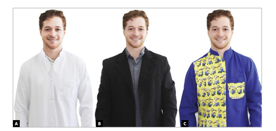
Figure 1 - Image of the orthodontists with different attire: A) White attire with white coat; B) Dark shirt with dark suit; and C) Colorful pediatric dentist's attire.

Missing maxillary lateral incisors are a common condition in daily orthodontic practice. The etiology of missing maxillary lateral incisors is multifactorial, including genetic predisposition, local infection or inflammation, usually related to heredity and evolution. In the face of such a clinical situation, we always face the dilemma of closing or opening the orthodontic space. We, orthodontists, tend to closure treatment, however, is this approach considered the best from the patient's perspective and in our clinical evaluation? With the proposal of answering these questions, Swedish researchers developed a clinical study<sup>2</sup> that evaluated patients submitted to space closure or space opening in cases of missing maxillary lateral incisors. The patients also answered a questionnaire regarding their satisfaction with the final aesthetic result. The conclusions obtained with this study revealed that both treatment options are valid, however, space closure is preferable.