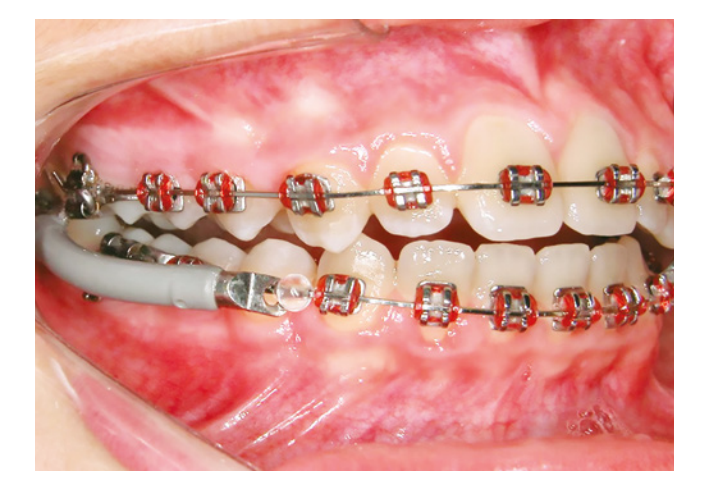
Figure 1 - Jasper Jumper appliance installed.