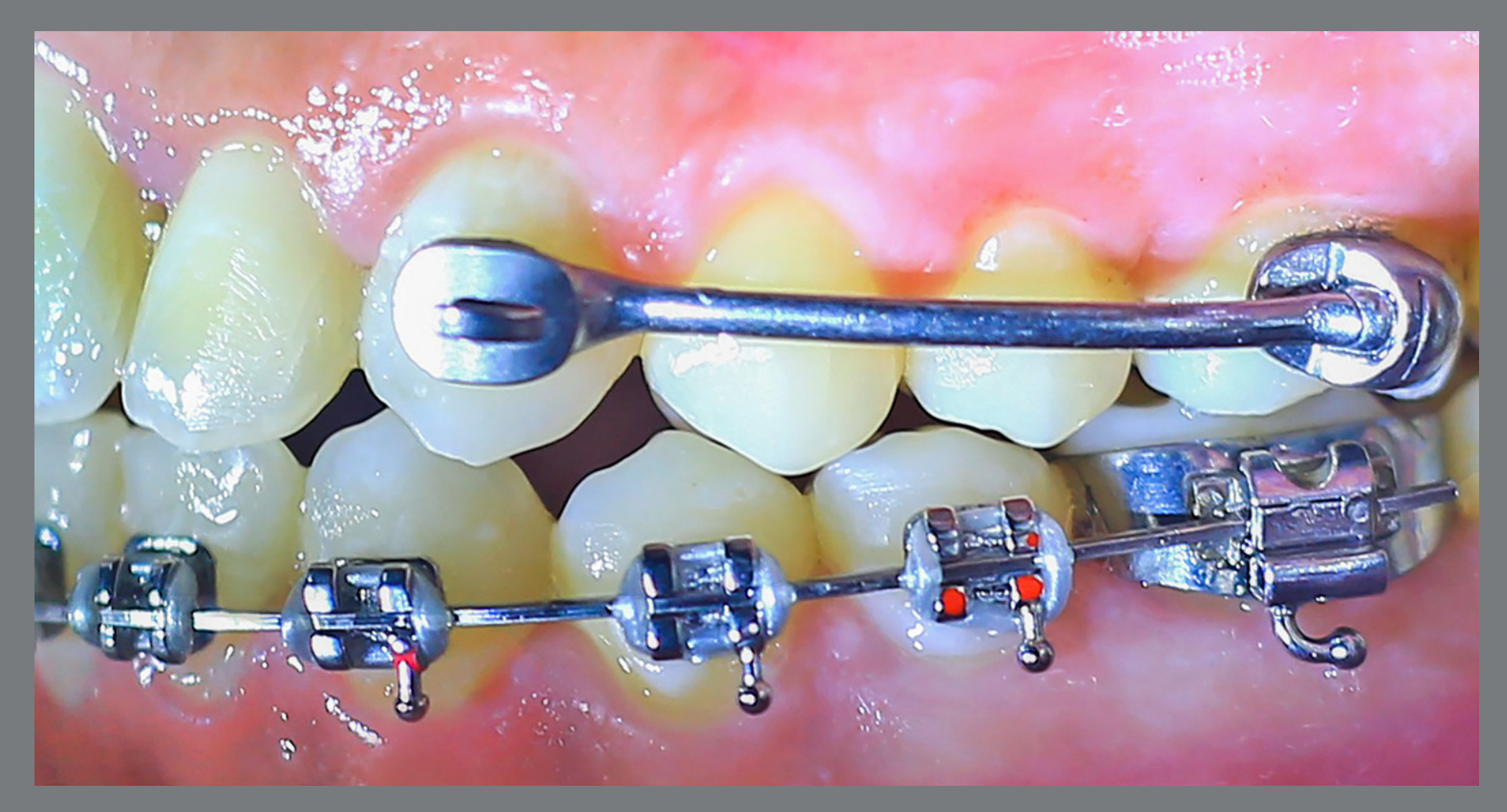
Figure 2: Bonded Carriere distalizer appliance.

All patients were instructed to use heavy Class II elastics with 1/4-in diameter (American Orthodontics, Sheboygan, Wis), attaching them from the mandibular molar band hook to the hook on maxillary cuspid pad of the distalizer. A force gauge (Dentaurum, Pforzheim, Germany) was used to measure the amount of force produced by Class II elastics once attached. Patients were instructed to wear the elastics all the time, except during eating or playing sports, and to change them after every meal.