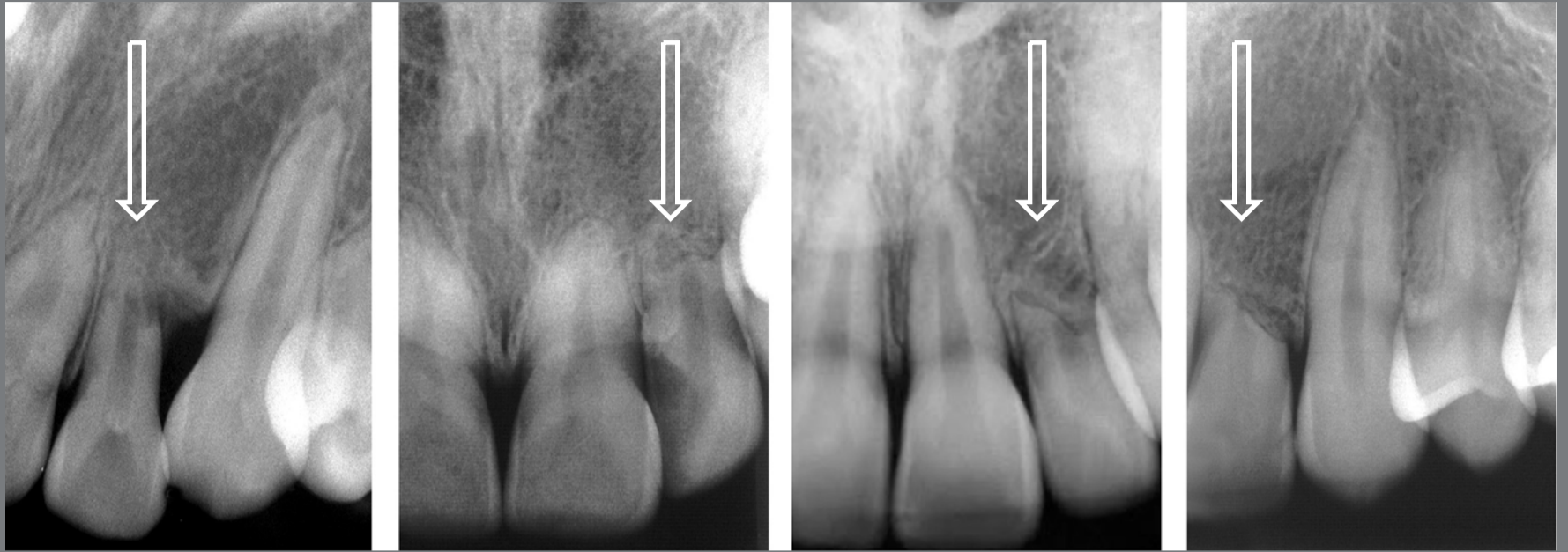
Figure 1: Four maxillary lateral incisors that have served as laterality guide for a period longer than 1 year, which would naturally and properly occur as function of the maxillary canines. The masticatory and occlusal overload induced establishment of the occlusal trauma lesion in its most advanced form, and it is characterized by inflammatory root resorption in plane (arrows). Pulp vitality is preserved.

In this situation described above, our experience with several cases has almost always led us to indicate this resorption as being part of the lesion or disease called “occlusal trauma”, with late manifestation of months and years of progression and preceded by other manifestations, which we will discuss next. Since the beginning of this “occlusal trauma” lesion, it has been caused by the chewing overload determined on the maxillary lateral incisors in this situation, when these teeth have been used as a guide for the movement of laterality, and not the canines (Figs 1 and 2).