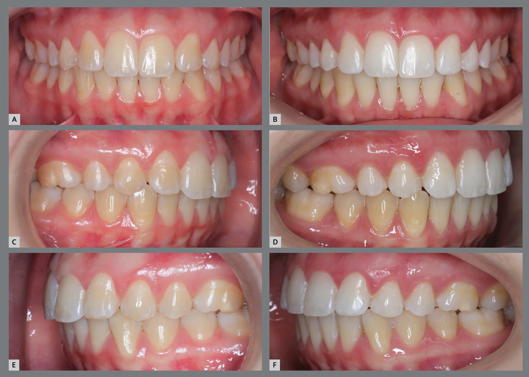
Figure 11: A) Frontal view of a case of congenital absence of teeth #12 and #22 orthodontically treated by space closure. B) Ten years after treatment completion, the patient started the tooth whitening process. C) Right lateral view of the final occlusion. D) Image ten years after treatment. E) Left lateral view of the final occlusion. F) The same image after ten years of treatment, evidencing on the photographs taken in the post-retention phase that the periodontium and anatomy of premolars involved with the group lateral disocclusion guidance remained healthy.

To date, there is no consistent scientific evidence to justify the constant search for canine protected occlusion as beneficial for all orthodontic patients, especially those with missing maxillary lateral incisors.<sup>17</sup>