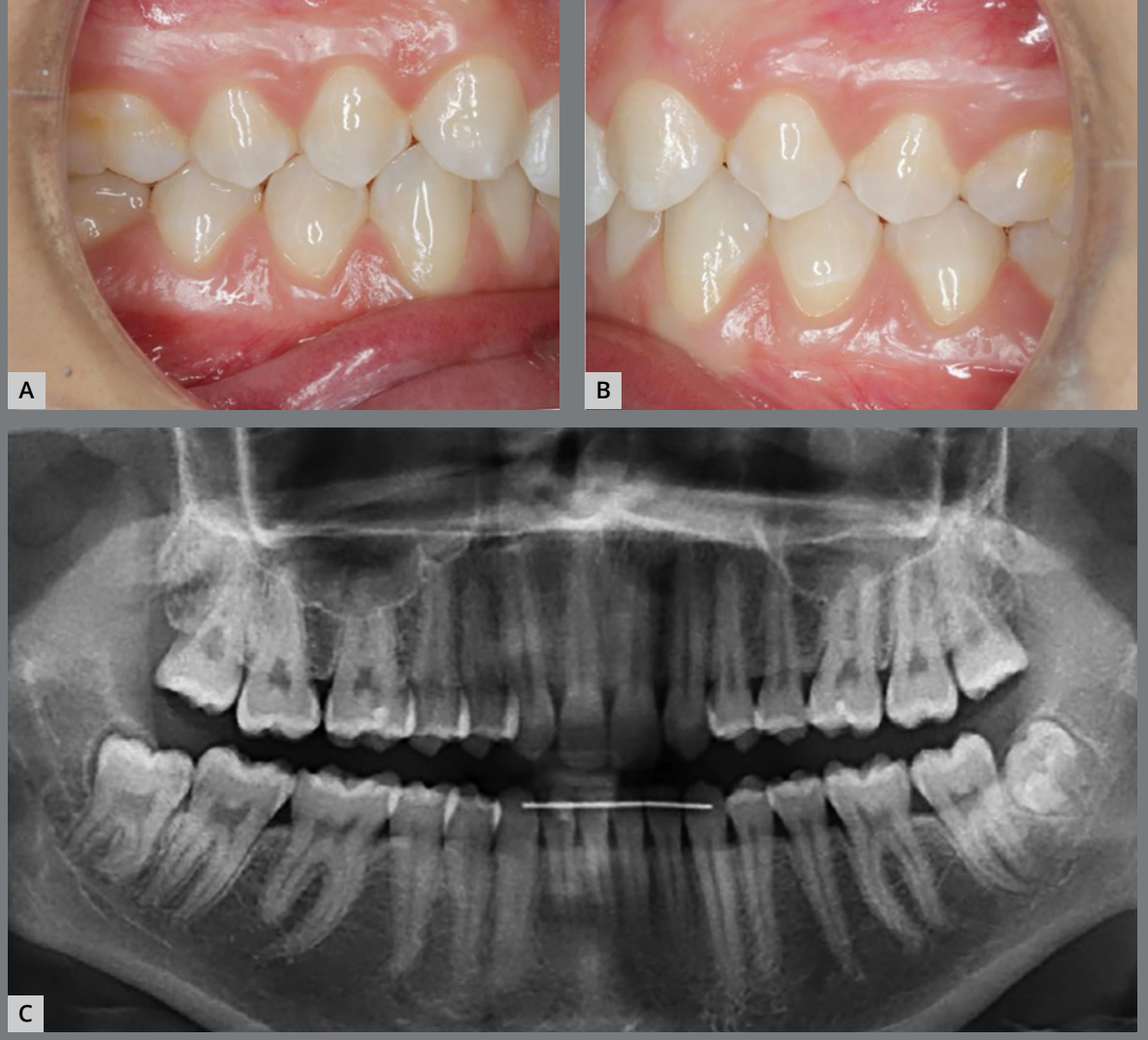
Figure 8: A, B) Posterior occlusion on the right and left sides, periodontal health in the premolar region with 7-year follow-up. C) Follow-up panoramic radiograph.