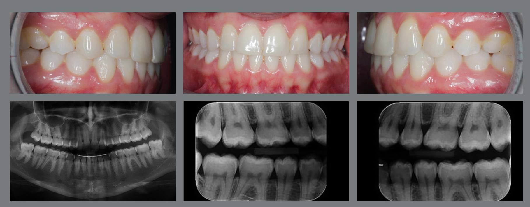
Figure 14: Images of the case, 8 years after completion of orthodontic treatment. Esthetic completion of the case was performed by restorative dentistry, by re-shaping of maxillary incisors, canines and first premolars.