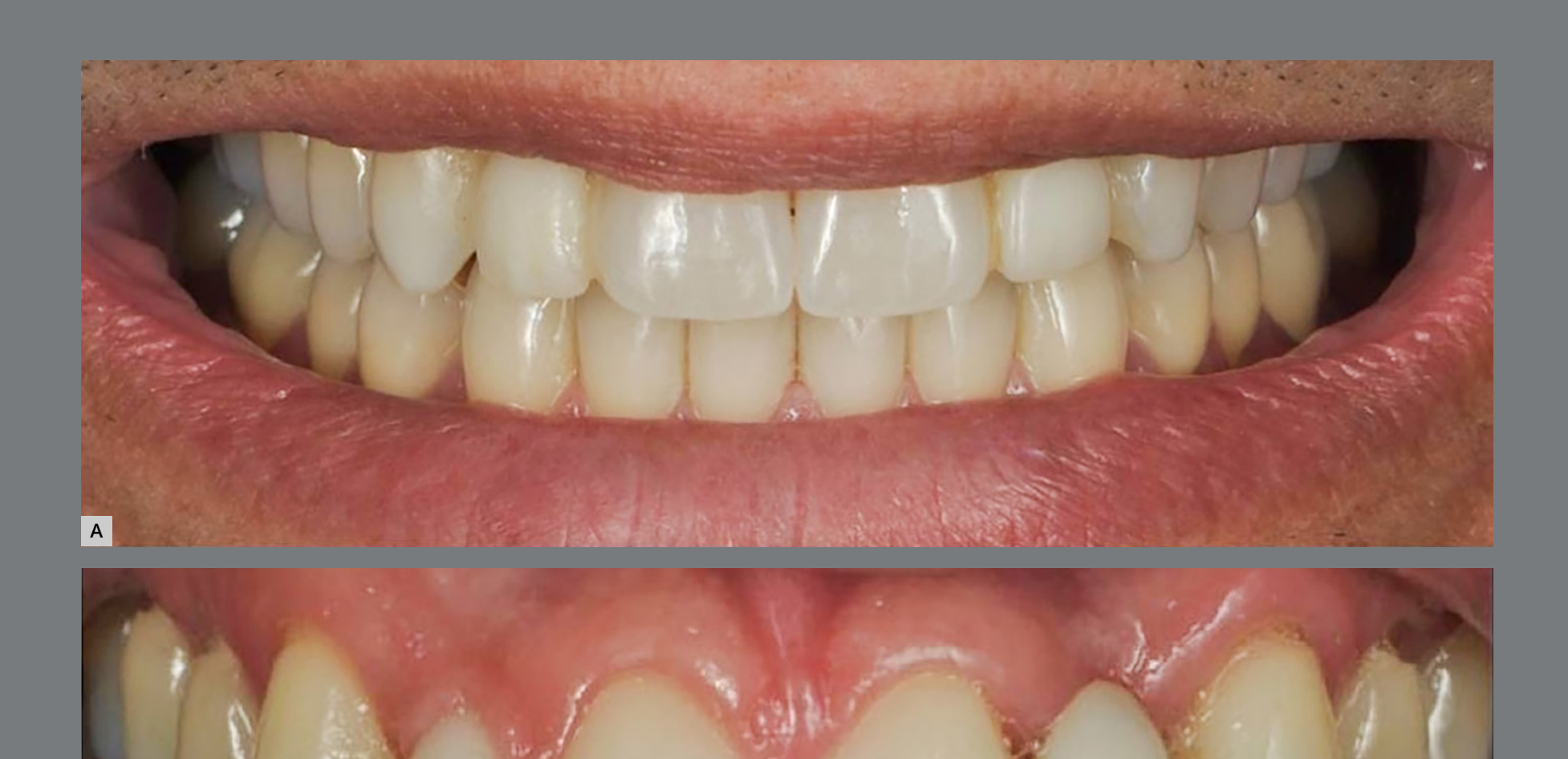
Figure 6: A) Image of adult patient with low smile, after orthodontic space opening for implant placement in the regions of maxillary lateral incisors. B) The presence of bone dehiscence on the buccal walls of teeth #12 and #22 could compromise the smile esthetics, if there was any degree of gingival exposure.