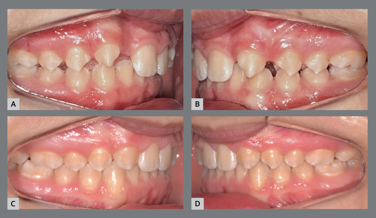
Figure 7: A, B) Lateral intraoral photographs of initial occlusion, with molars and canines in Class II relationship, congenital absence of maxillary lateral incisors, generalized spaces in the maxillary arch. C, D) Post-orthodontic treatment photographs showing closure of spaces, with mesialization of maxillary posterior teeth.