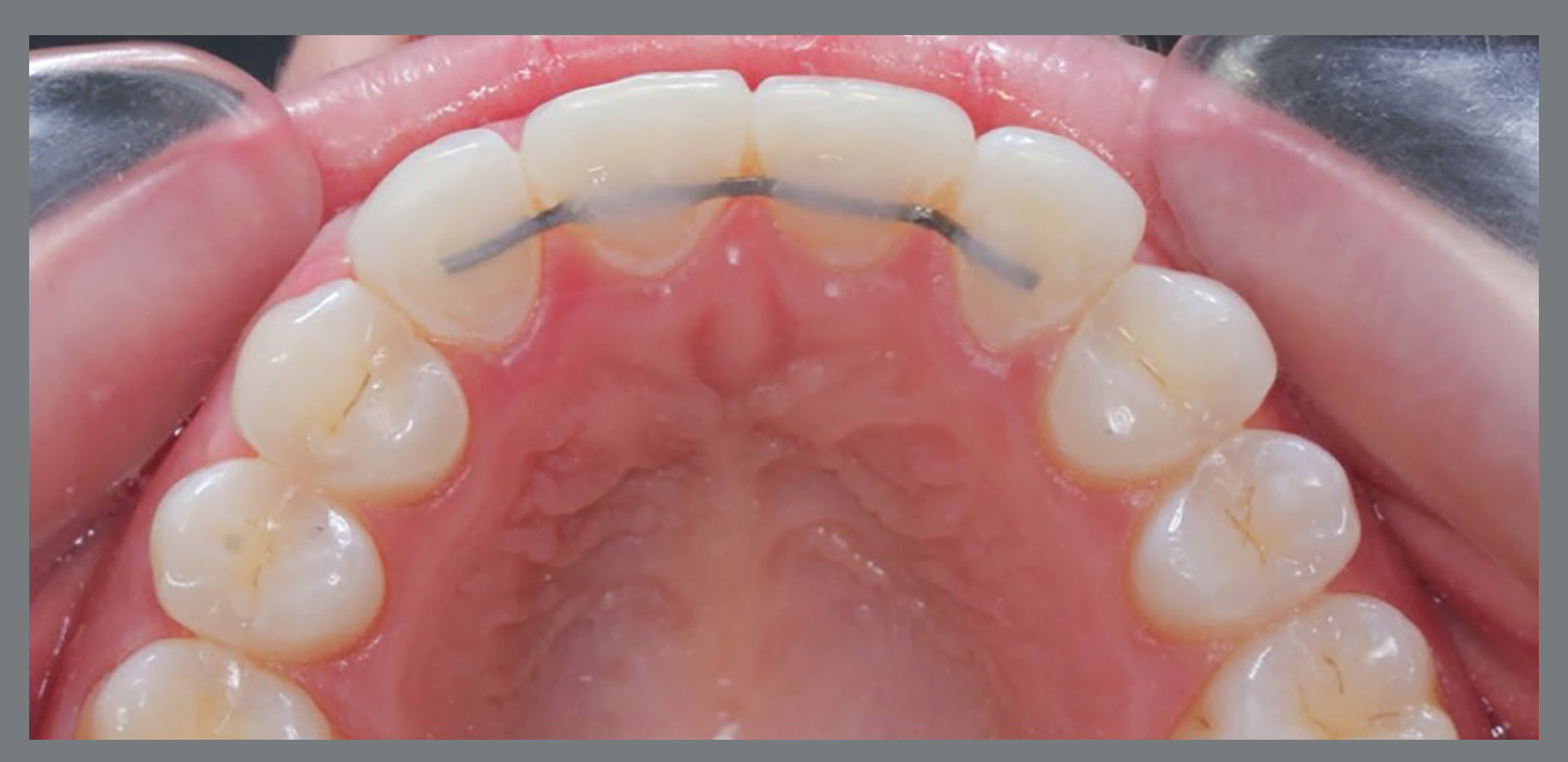
Figure 17: Retainer bonded to central incisors and canines, to increase treatment stability and prevent reopening of small spaces.

be remembered that the inclinations of roots adjacent to the edentulous spaces must be followed radiographically, due to the risk of invading the space left for the implants.<sup>30</sup>