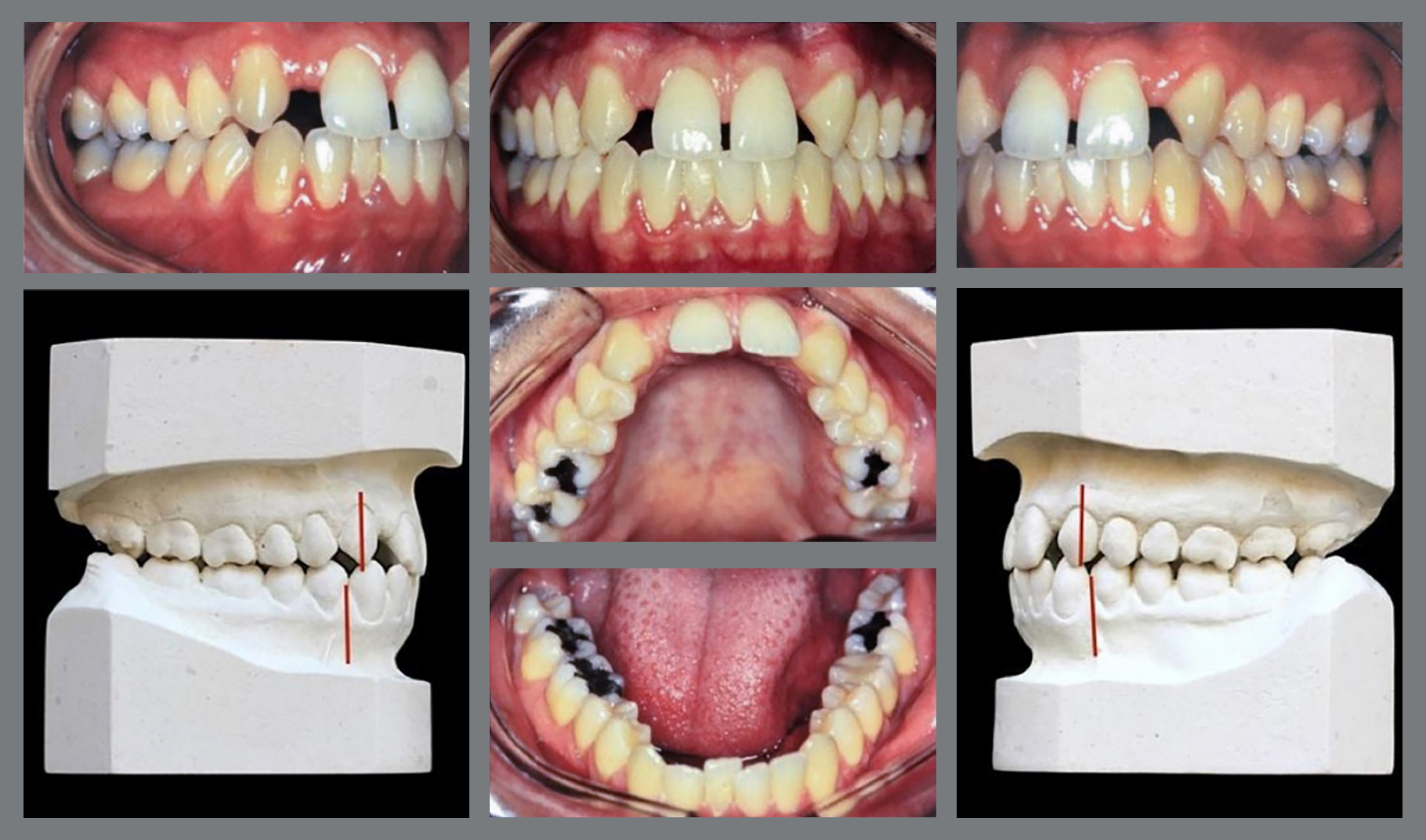
Figure 3: Adult patient, with absence of maxillary lateral incisors, maxillary anterior spaces and mandibular crowding. Class II canine relationship, mild overbite and overjet.

Concerning adult patients (Fig 3), decision-making should be based mainly on the anteroposterior relationship of teeth, smile line height and patient profile. If there is no significant facial and dentoalveolar growth, the orthodontist may provide excellent results in shorter treatment periods (Fig 4).