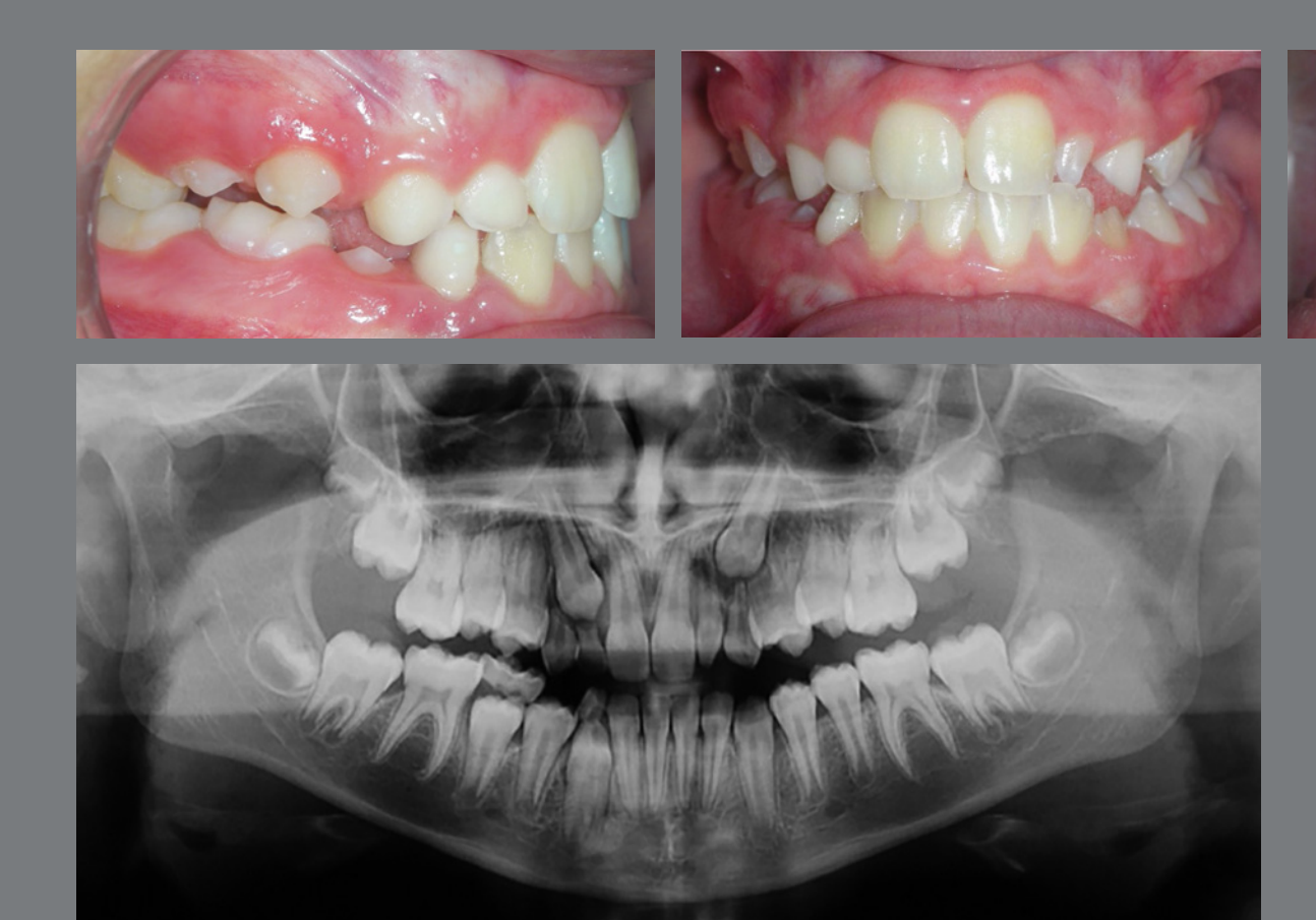
Figure 12: Young patient, aged 9 years at completion of mixed dentition, with molar and canine relationship in key occlusion, posterior crossbite on the left side, absence of tooth #12 and microdontia associated with a peg-shaped crown of tooth #22. The maxillary left canine had a radiographic appearance of possible impaction.