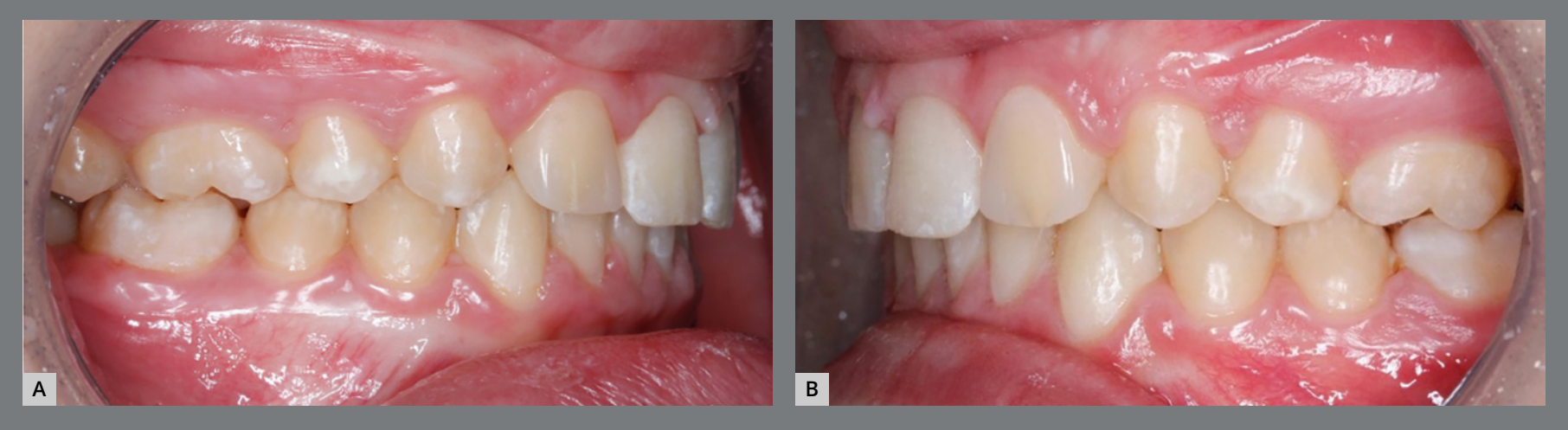
Figure 10: Photographs taken five years after treatment completion, showing a stable occlusion, besides dental and periodontal health.