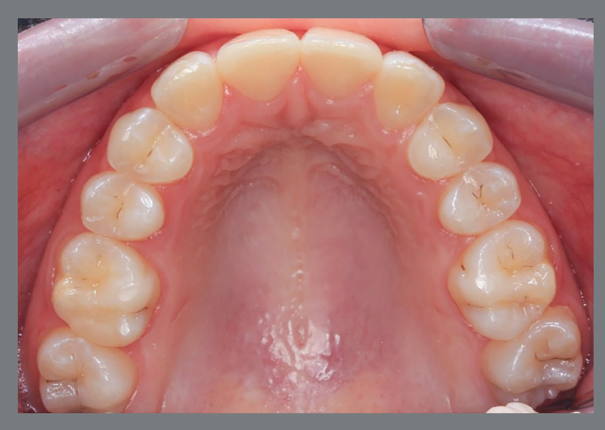
Figure 16: Canines with palatal root torque and slightly mesially rotated maxillary first premolars.

Some wear on the palatal surface of the canine may also be necessary to avoid prematurity and occlusal interference with the mandibular incisors in static and dynamic occlusion. Another aspect that should be foreseen when planning these cases is the possibility of appearance of tooth-size discrepancy, which can affect the quality of intercuspation of these cases. This aspect should be reviewed during the orthodontic finalization phase, and possible mesiodistal adjustments should be performed.<sup>11,30</sup>