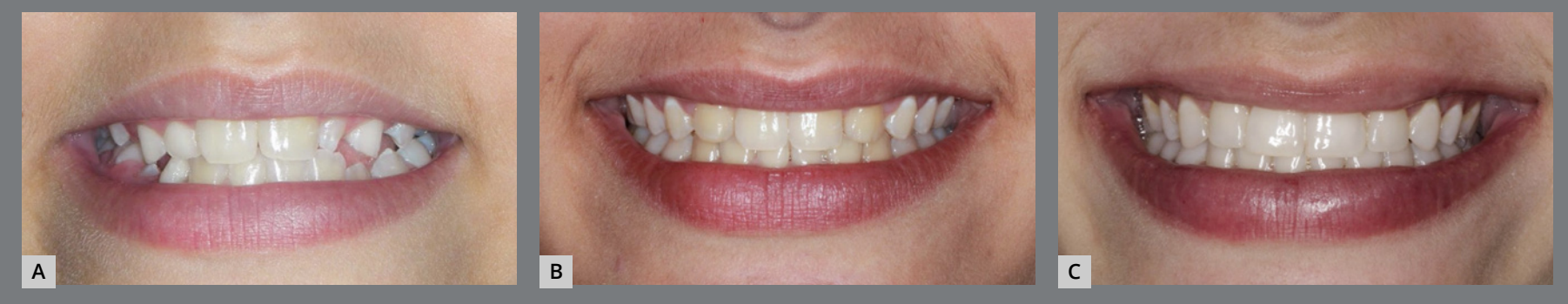
Figure 15: Smile images: A) Initial; B) After completion of orthodontic treatment, in which it is possible to observe the change in color and anatomy of canines; C) After esthetic restorative procedures.