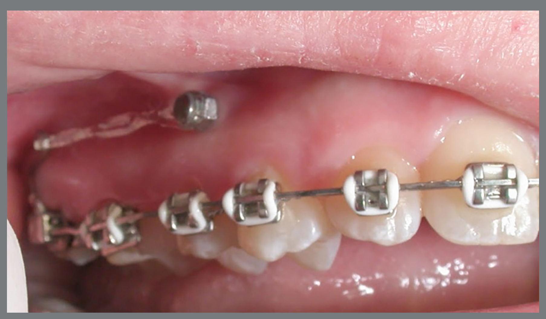
Figure 5: Hook made with stainless steel wire, fitted to the distal part of the tube of tooth #17, connected to the mini-implant between the roots of teeth #14 and #15 using a chain elastic, aiming at mesialization of the posterior segment, closing the spaces by anchorage loss.

dentoalveolar mesialization, consequently achieving esthetic and functional occlusion, without damage to the profile, even in patients with maxillary deficiency.8 With the same objective, skeletal anchorage can also be used in the maxillary arch to lose anchorage of posterior teeth without altering the inclination of maxillary incisors, as shown in Figure 5.