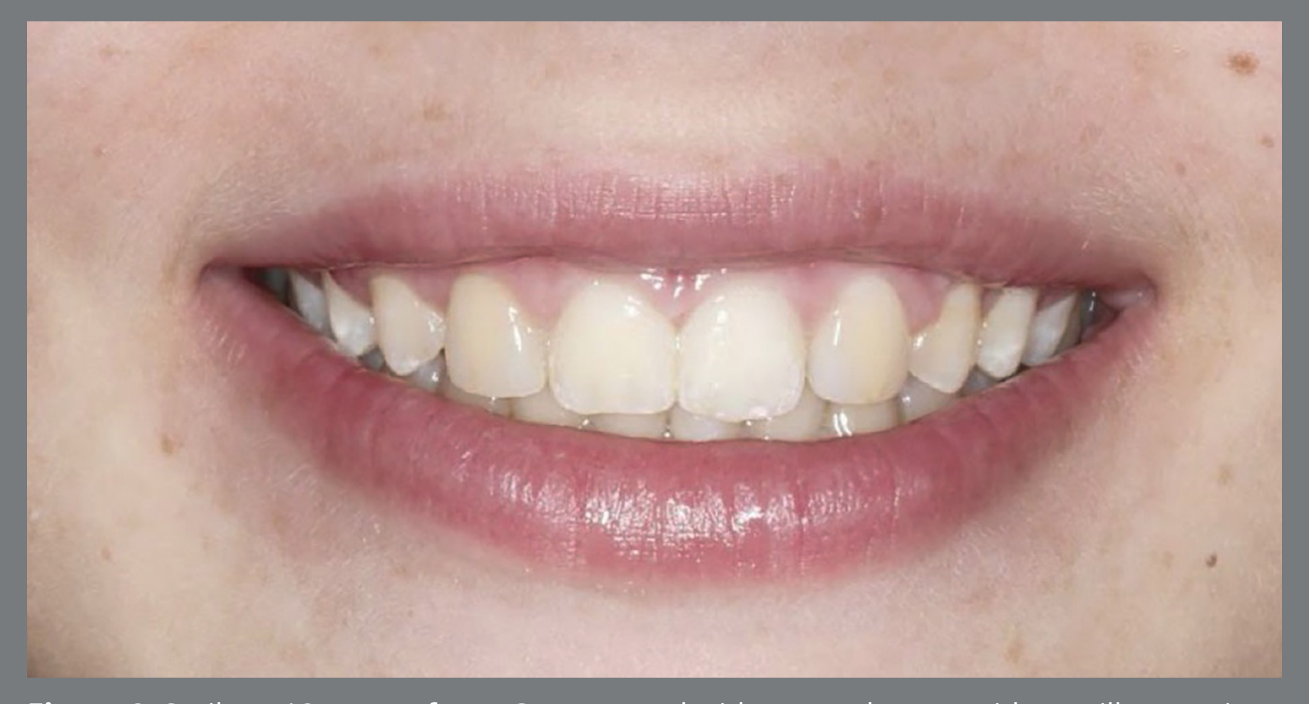
Figure 2: Smile at 13 years of age. Case treated with space closure, with maxillary canines replacing the missing maxillary lateral incisors.