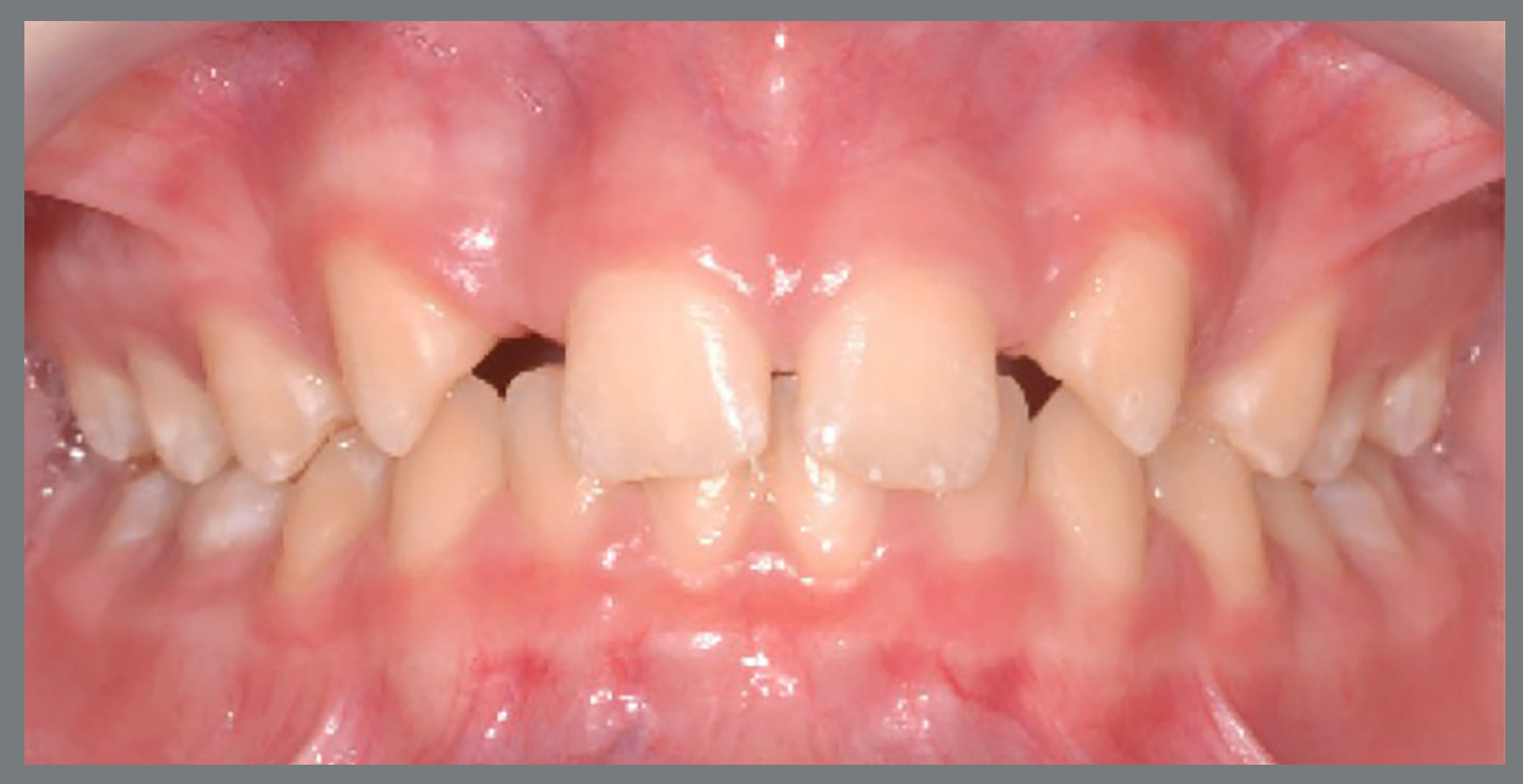
Figure 1: 11-year-old female patient with esthetic complaint due to absence of maxillary lateral incisors.