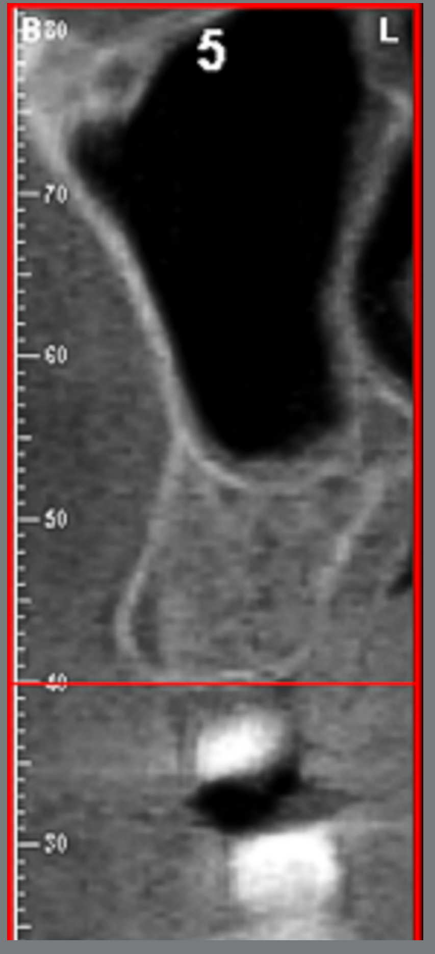
Figure 2: Measurement of vestibular and lingual cortical bone thickness at the determined heights (5mm from the bone crest).

of the maxilla on both sides); palatal maxilla (measurements made on the palatal bone cortex of the maxilla on both sides); Mandible (measurements made on the vestibular cortical of the mandible on both sides). To minimize possible biases in the survey, each subject was given a registration number, which was obtained by lot, to determine the sequence of the images to be analyzed. A trained and calibrated examiner performed measurements. Twenty-five individuals (20% of the sample) were initially evaluated and reassessed after three weeks to verify reproducibility. The Kappa index was used for categorical variables (ANB and VERT index), and the intraclass correlation coefficient (ICC), for quantitative variables (cortical bone thickness). Excellent reproducibility (Kappa> 0.80 / ICC> 0.75) was found for all measures analyzed.