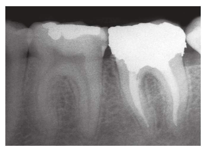
Figure 6. Control X-ray after 1 year.