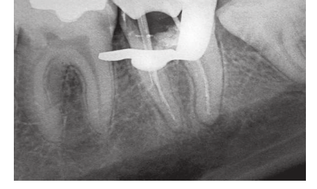
Figure 4. Working length.