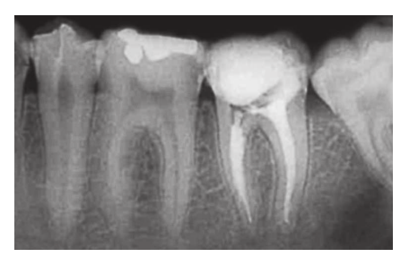
Figure 5. Root canal obturation.