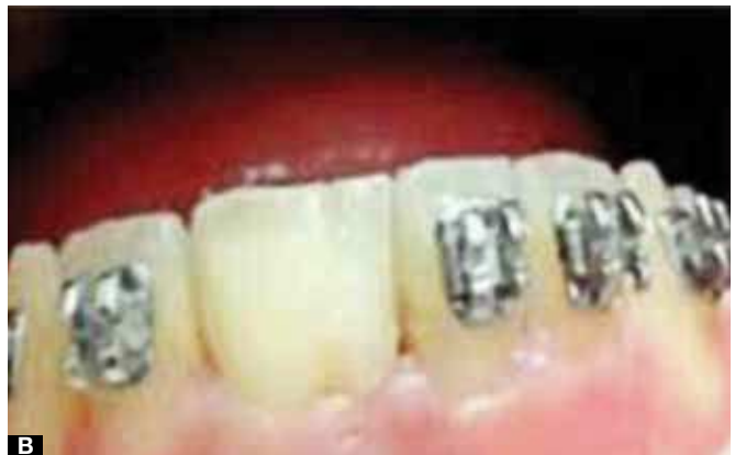
Figure 1. A) Image of the presence of all mandibular teeth in the arch, and atypical crown in the #41 B) Clinical aspect of the large crown e appearance of fusion between #41 and supernumerary.