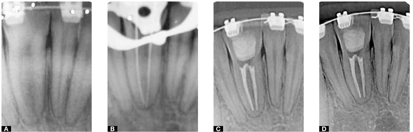
Figure 3. A) Image of periapical radiograph showing normal aspect and differentiated anatomy, featuring the dental element fusion and the presence of single root with two radicular canals. B) Determination of working length. C) Root canal filling and tooth sealed with universal restorative. D) One year follow-up.