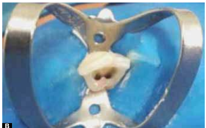
Figure 2. A) Image of the absolute isolation of operative field with rubber dam and clip 212. B) Coronal opening and the entrance orifices were located.