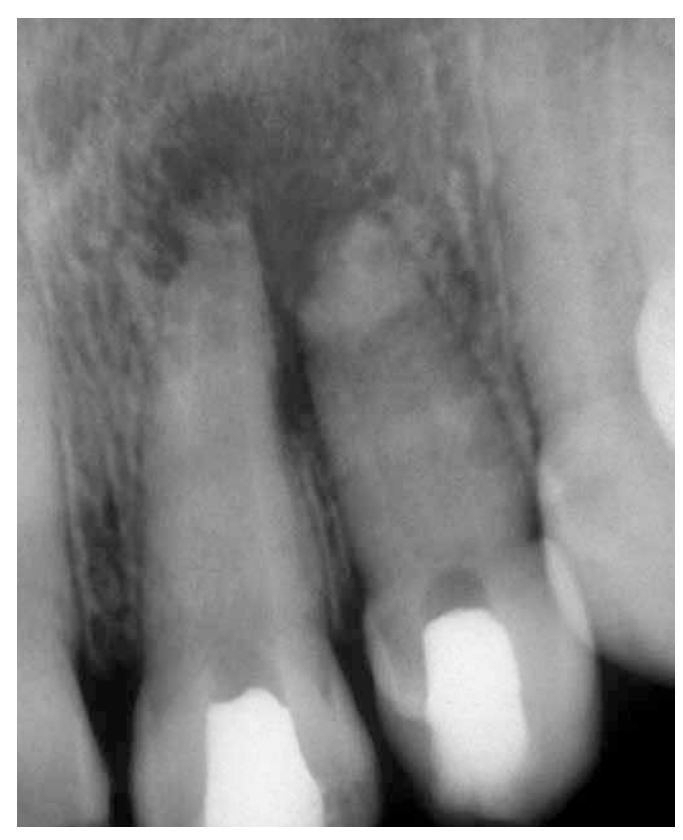
Figure 4. Teeth with intracanal dressing after a period of nine months, showing regression of the periapical lesion, stabilization of the beginning of resorptions and root closure.

After three years of completion of treatment the patient was called for the first radiographic control, when radiographically it was observed repair of the periapical lesion with absence of root formation and root resorption. In element 21 in the third apical was possible to observe slight thickening of the periodontal ligament (Fig 8).