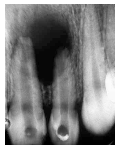
Figure 1. Initial radiograph showing incomplete root formation, extensive radiolucent periapical and root resorption.