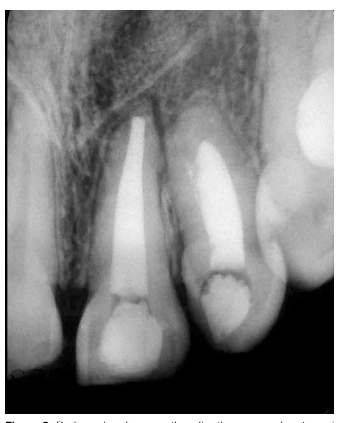
Figure 8. Radiography of preservation after three years of root canal filling showing periapical lesion repair and absence of root formation and root resorption.