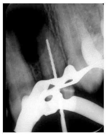
Figure 3. Tooth 22 Odontometry for confirmation of the working length.

of EDTA, another drying was carried out. Calcium hydroxide paste P. A with propyleneglycol was inserted into the root canal, which is replaced when it appeared radiographically that the intra-canal medication had been partially resorbed. This was done to induce apicification or formation of a barrier mineralized in the apical foramen, as well as stabilization of root resorption. After four exchanges of intracanal dressing over a period of nine months, regression of the periapical lesion was observed radiographically, stabilization of resorptions and root closuret (Fig 4).