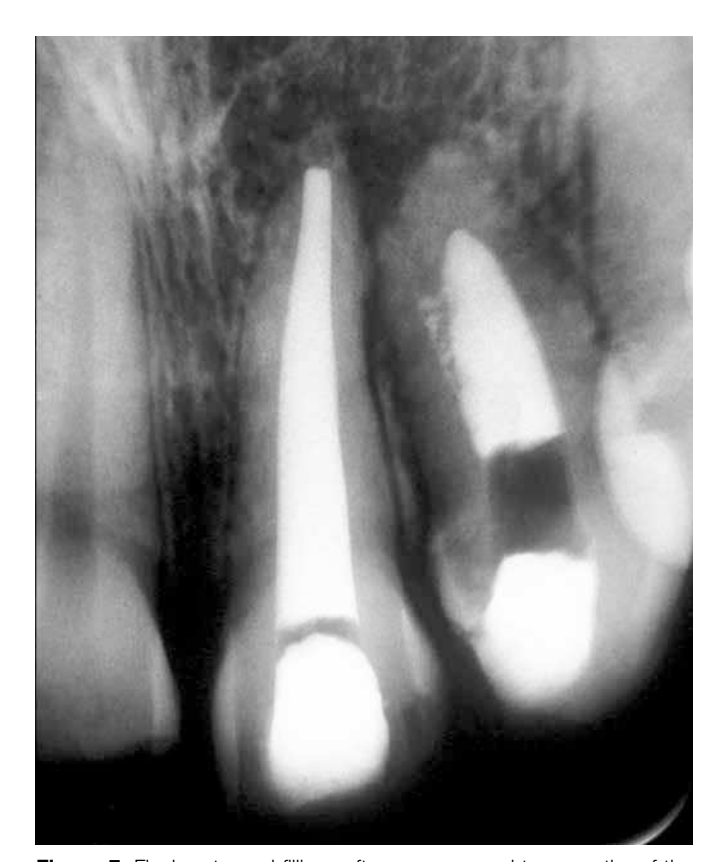
Figure 7. Final root canal fillings after one year and two months of the beginning of the endodontic treatment.