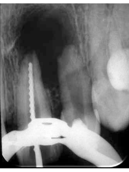
Figure 2. Tooth 21 odontometry for confirmation of the working length.