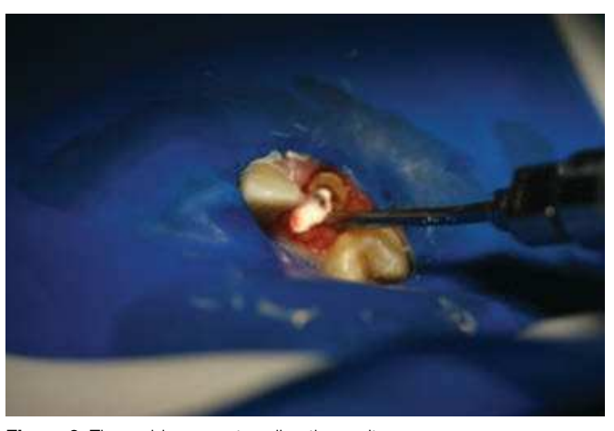
Figure 6. Zinc-oxide cement sealing the cavity.