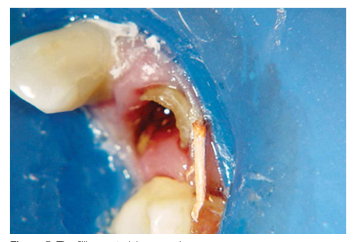
Figure 5. The filling material removed.