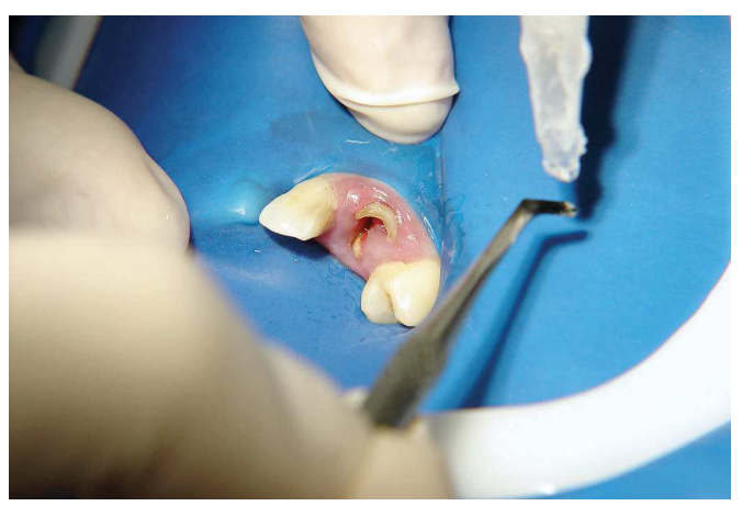
Figure 3. Applying ethyl cyanoacrylate between the rubber dam and the periodontium.

Paracetamol 750 mg, 8/8 hours for 2 days and Amoxicillin 500 mg, 8/8 h for 7 days were prescribed and the patient referred to the Surgery department (Fig 7), where appropriate evaluation was performed in order to remove the remaining root.