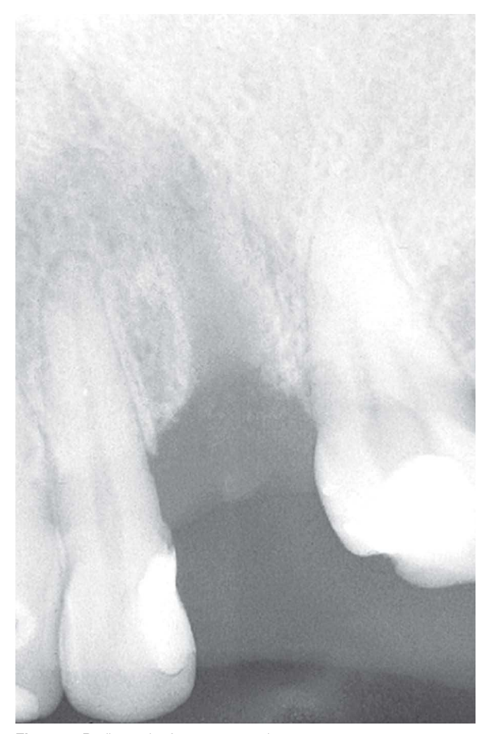
Figure 7. Radiograph after root extraction.

Complementary exams are necessary to confirm the disease: Screening tests for initial evaluation of hemorrhagic coagulopathies, specific tests for diagnostic confirmation, and discriminatory tests that allow the classification of the disease, which may take some time.<sup>3</sup>