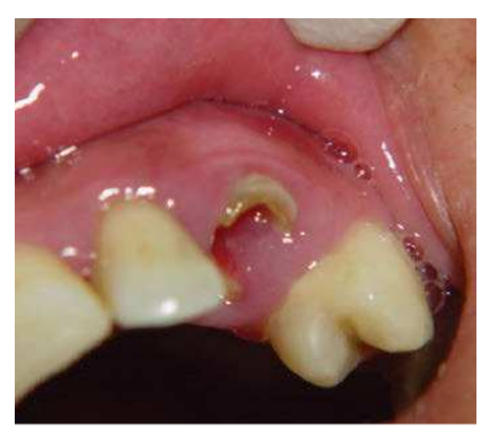
Figure 1. Clinical aspects of tooth #23.

The treatment was performed using anesthesia with 2% mepivacaine with 1:100.000 epinephrine (DFL Indústria e Comércio S.A., Rio de Janeiro, Brazil). The rubber dam could not be done in the conventional manner, due to the extension of the carious process, the proliferation of gum tissue and the patient's conditions. It was sequentially perforated three times in order to involve teeth #22, #23 and #24. After positioned, ethyl cyanoacrylate (Loctite® - Super Bonder Precisão - Henckel Ltda, São Paulo, SP, Brazil) was applied