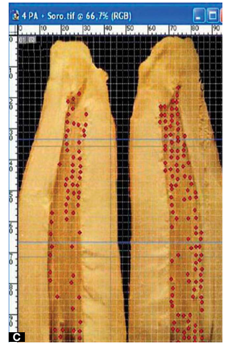
Figure 1. A) Longitudinal root section. B) Apical, medial and cervical thirds definition. C) Quantification of CH residues.