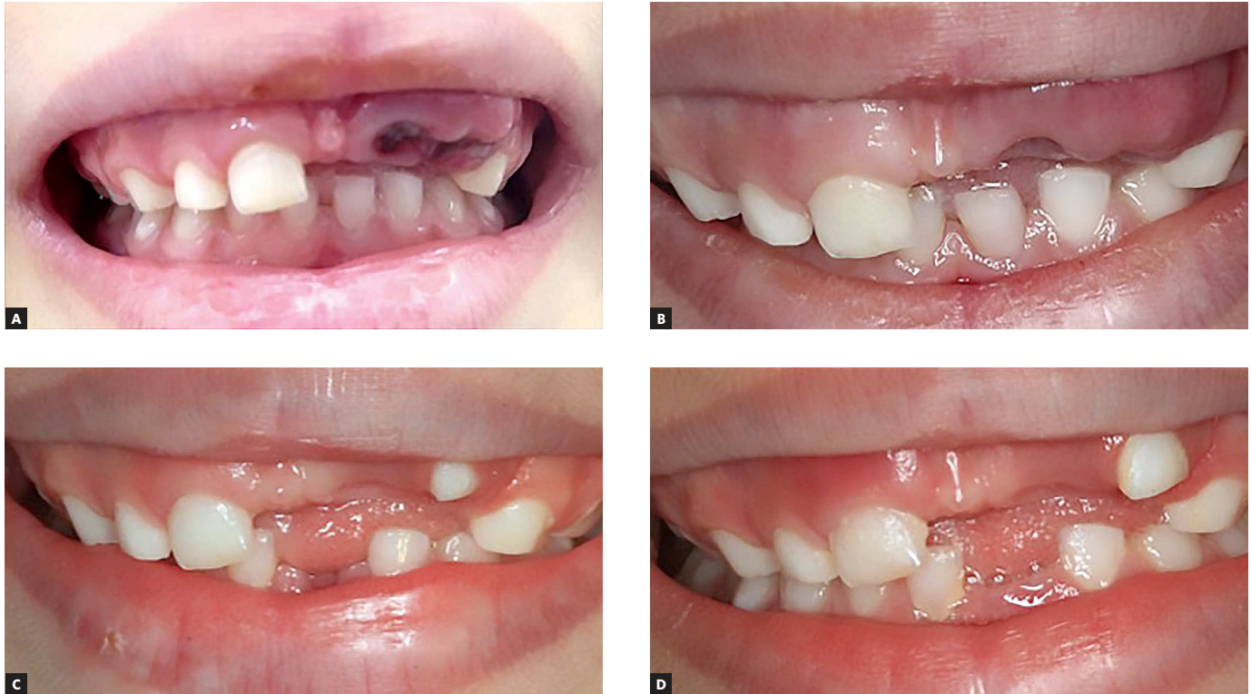
Figure 1. A) First session intraoral examination revealing absence of teeth #61 and #62 with swelling and redness in this region. B) After one week, swelling in the upper lip and the gingival region of teeth #61 and #62 subsided with healing of laceration. C) After 30 days, there was spontaneous eruption of tooth #62. D) After four months, tooth #62 had erupted buccally without changes of color and fistula.