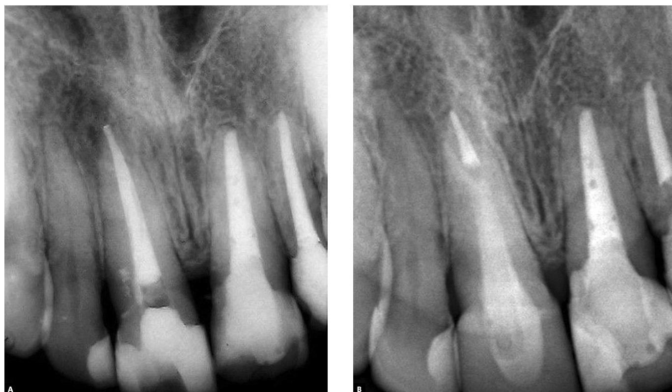
Figure 5. A) Final radiograph taken immediately after filling was completed; B) Post-operative control radiograph take 2 years and 6 months after treatment was completed.

to remove the original filling material, followed by repeated shaping and adequate infection control and prevention, essential to maximize the success of new treatment. This retreatment should include rigorous asepsis, complete cleaning and shaping using antimicrobial irrigants, application of intracanal dressing and repeated root canal filling, as well as satisfactory crown sealing. 6