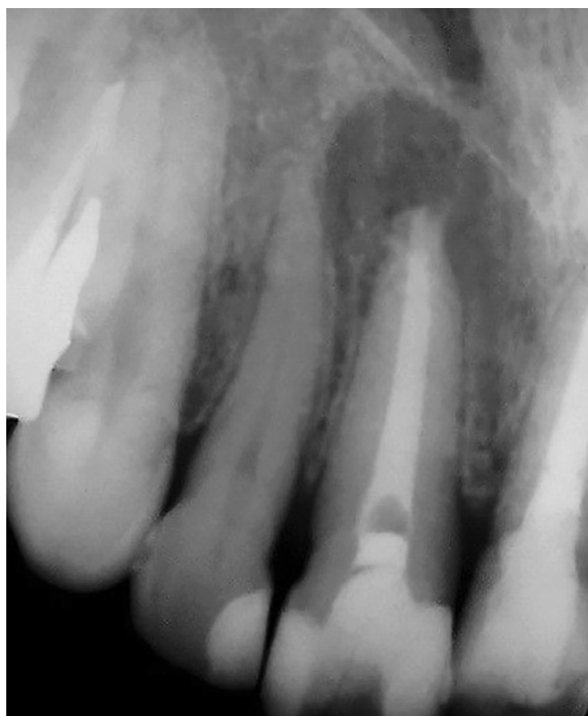
Figure 3. Radiograph shows extruded filling material oozing out of fistula.