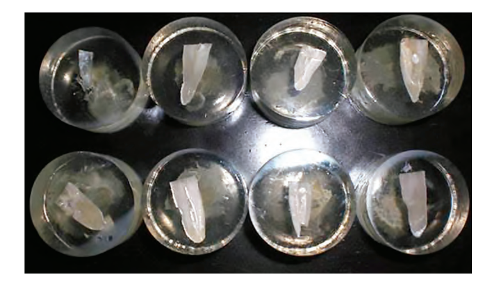
Figure 2. Samples in acrylic resin.

The results of the short, medium and long term effect of 5% sodium hypochlorite and calcium hydroxide in the chemical properties of the dentine are given in Table 1. The results derived from the analysis by electronic microprobe were expressed in percentage of the total weight. The results of group C, show that irrigation with saline for 1 minute and subsequent retention of the tooth in serum seems to be harmless to the dentine. There were no changes in Ca / P ratio. Irrigation with sodium hypochlorite for 1 minute and the subse-