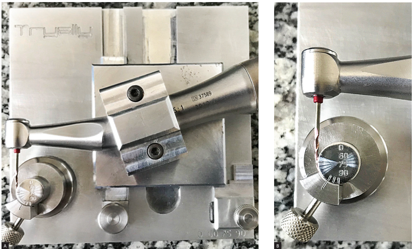
Figure 1. A) Representative image of the cyclic fatigue device used in this study. B) Representative image of the Logic 25.06 coupled on the cyclic fatigue device with 60° and 5 mm of radius of curvature.

bethport, NJ) was applied. The time to failure was recorded using a digital chronometer and video recording was made simultaneously to ensure the exact time of instrument fracture. The number of cycles to failure (NCF) was calculated using the following formula: time to failure (in seconds) X RPM/ 60.