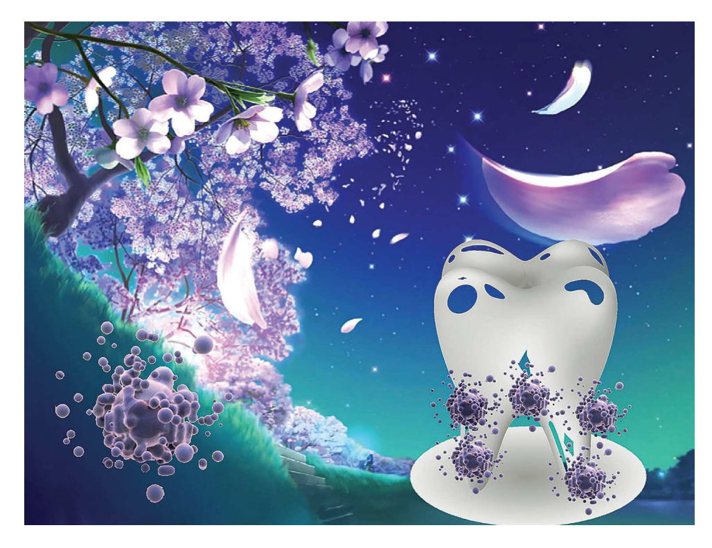
Figure 1: Apoptosis on the root surface of a deciduous tooth. In the background, there is a landscape illustrating flowers that lose their petals or a tree that loses its leaves. In Greek, this is the meaning of apoptosis.

enzymes or without "bothering" neighboring cells or damaging tissue components. Whenever neighboring cells recognize any fragments, they aid macrophages in the region to phagocytize them.