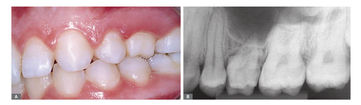
Figure 7: Occasionally, and in a special manner, some cases of adult deciduous teeth are temporarily solved with wear and movement of teeth into the space aimed at their permanent successor. Nevertheless, it should be highlighted that those are temporary solutions which might not always be the best overall option to patients.