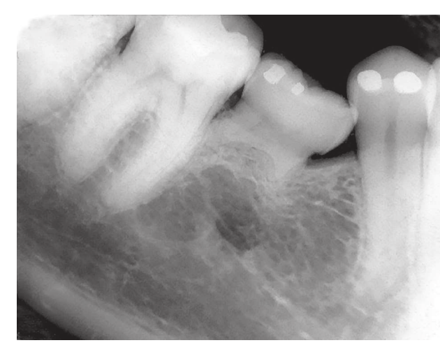
Figure 6: Infraocclusion of a deciduous tooth remaining in the patient's mouth, and size discrepancy between permanent and deciduous teeth promoting displacement and irregular space closure, with proclination of neighboring teeth and interference in occlusion. Note that the deciduous tooth presents with replacement tooth resorption.

aforementioned conditions, with a view to restoring occlusion, the tooth crown will be the only structure found a month later. Occlusal overload will be established and occlusal trauma will speed the process of replacement resorption up (Fig 7).