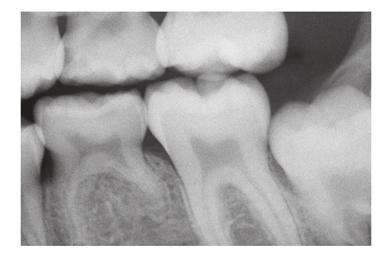
Figure 5: Adult deciduous tooth with replacement tooth resorption after alveolodental ankylosis.