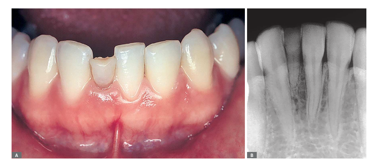
Figure 2: Deciduous tooth found in an adult patient's mouth, revealing infraocclusion and tooth root with preserved structure, but also revealing irregular areas of surface resorption, with imprecise lamina dura delimitation and periodontal space.

mineralized tooth surfaces are exposed, without being protected or enclosed by cementoblasts, regardless of being deciduous or permanent teeth, they tend to be naturally colonized by clastic cells, thus setting up areas of root resorption.