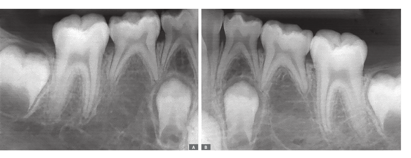
Figure 3: Deciduous molars in a patient with partial anodontia of second premolars. At this stage, the case must be well planned with a combination of knowledge and experience shared by pediatric dentists, implant dentists and orthodontists, without postponing precise clinical decisions.

outer ones. Root resorption is triggered as soon as a deciduous tooth is fully formed, and does not rely on permanent successors and their tissues (Figs 2 and 3).