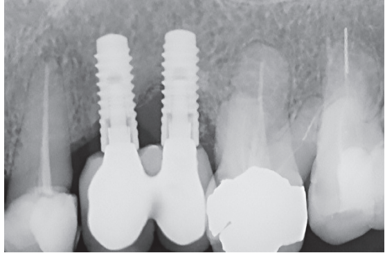
Figure 11 : Dental X-ray follow-up after 24 months, presenting an image compatibly with a bone regeneration around of the implant.