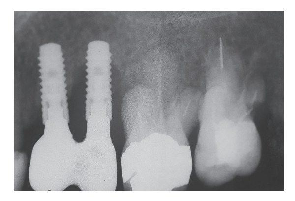
Figure 1 : Initial dental X-ray indicated bone lost surrounding the implant 25.

Prior to the surgery, the provisional cemented crown was removed and a cover screw was