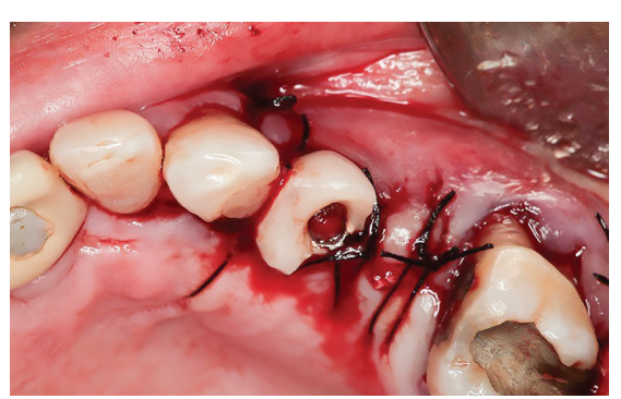
Figure 9: Suture with supramid 4 zeros (B. Braun<sup>®</sup>).

In the post-op the follow medication was prescribed: amoxicillin and clavulanic acid 875+125mg (Clavamox DT<sup>®</sup>) 12/12h during 8 days, clonixin 300mg (Clonix<sup>®</sup>) SOS, ibuprofen 600mg (Brufen<sup>®</sup>) 12/12h during 5 days and chlorhexidine mouthwash 0,12% (Eludril Perio<sup>®</sup>) 3 times/day during 10 days. After one week, the suture was removed.