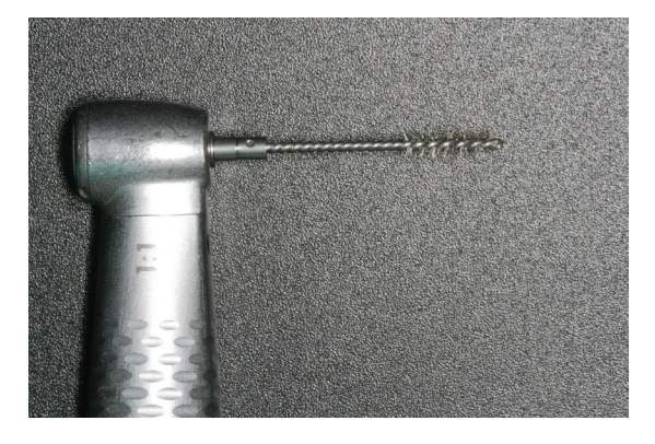
Figure 4: TiBrush® device.