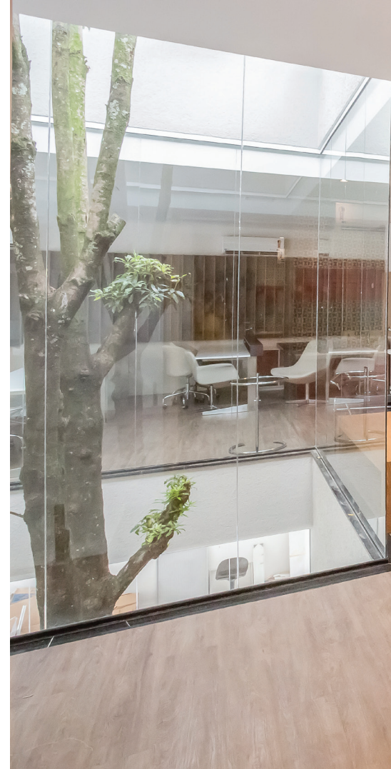
Figure 10 to 13:

Nature is integrated in project. Preservation of a native tree in the land lot, protected by glass walls, is evidence of our concern about sustainability. It also adds light and sophistication to area reserved for classes, which may also be adapted for events.