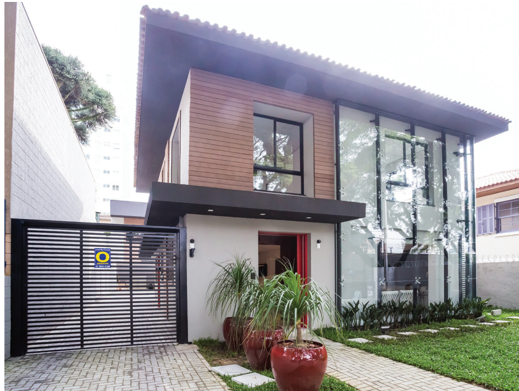
Figure 1: Front façade, where windows stand out.