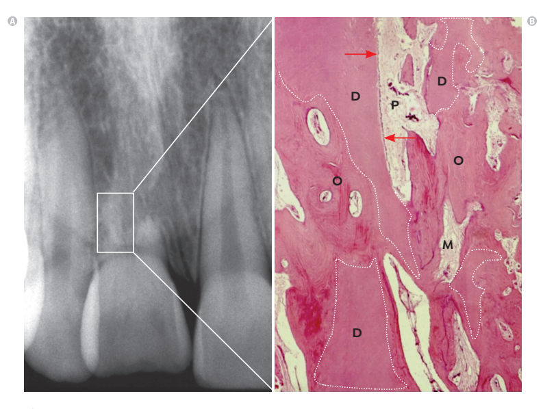
Figure 2: In tooth resorption by substitution, dental fragments (D) remain in place for long periods as they are reabsorbed in the context of bone remodeling. In some dentin fragments (D) areas with odontoblastic layer (arrow) and pulp (P) are still observed. In the other areas that have already been replaced, the bone (O) with its trabeculae and medullary spaces has normal organization and structures (M = medullary spaces) (H.E.; B=40X)

On the surface of the implants, bone neoformation obeys the biological principles of osseointegration, regardless of whether there are areas where there are fragments of dentin and cement in-between the bone structures in the region.