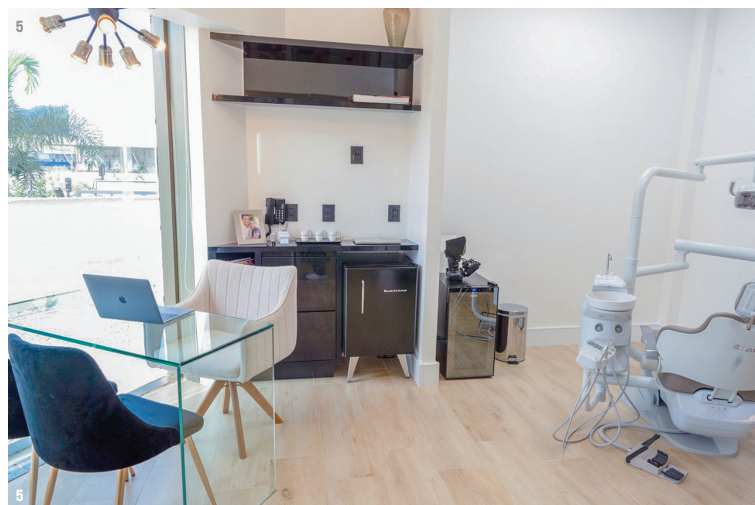
Figure 5: Office 2.