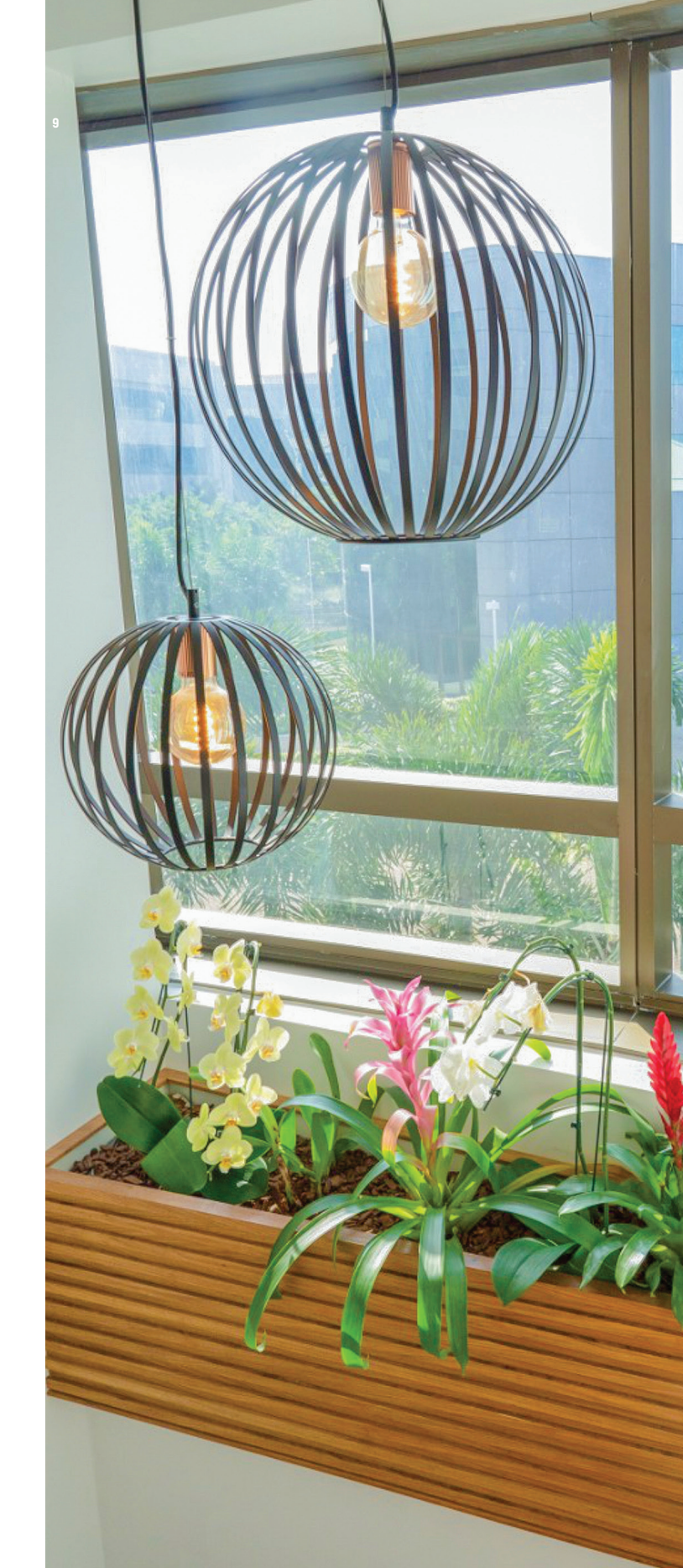
Figure 10: Natural flowers for ambiance.