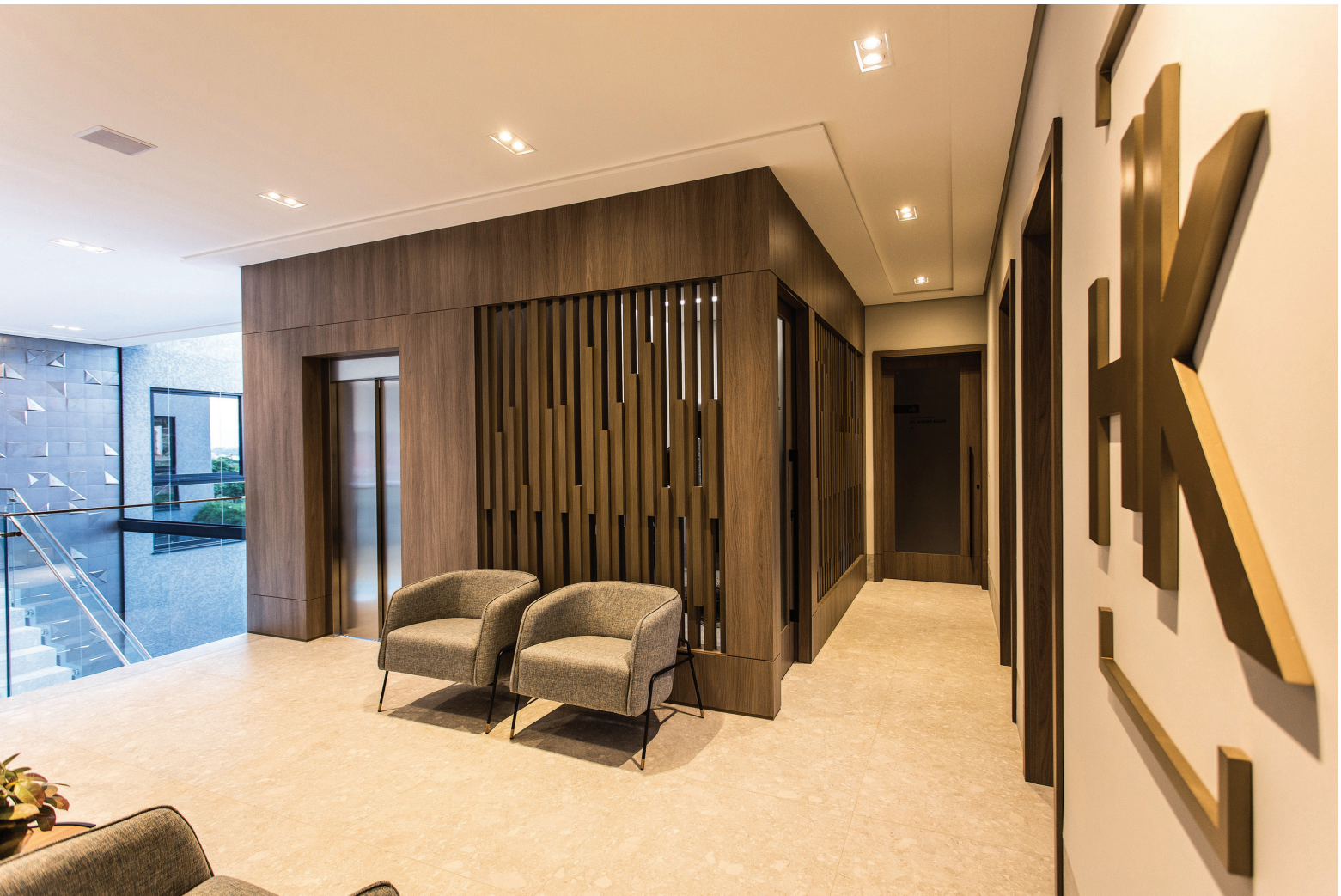
Figure 12: Circulation of the upper floor, with abundance of natural light.