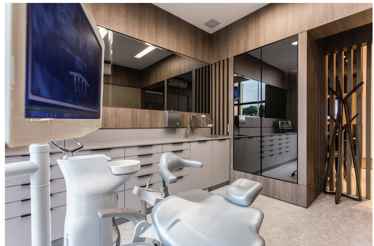
Figure 10: Featured, procedure room and, in the background, the care room of one of the dentists and owner of the clinic.