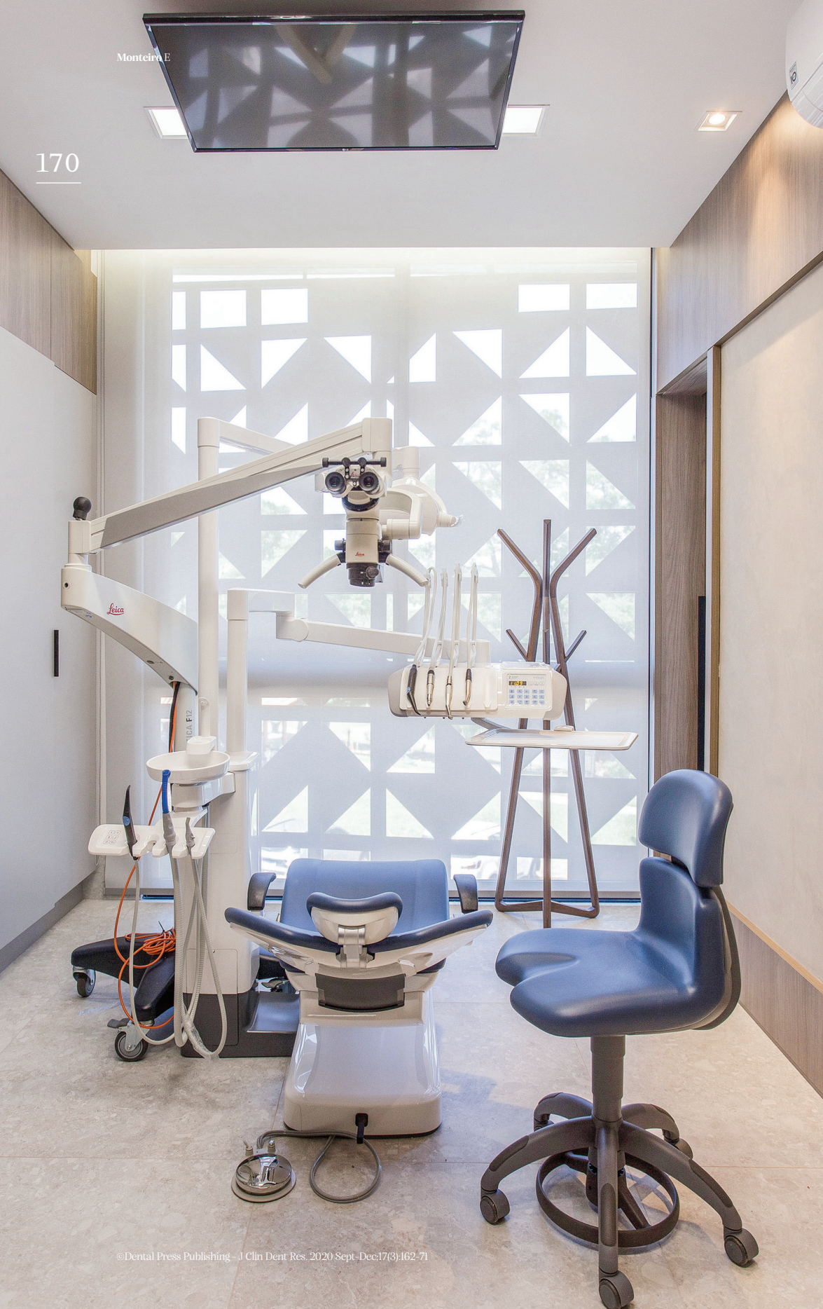
Figure 11: Detail of laser-cut corten steel applied as a visual and solar barrier to the upper floor care rooms.