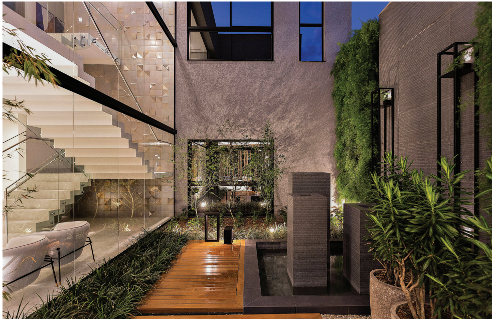
Figure 3 and 4: Detail of the visual integration between winter garden and indoor circulations.