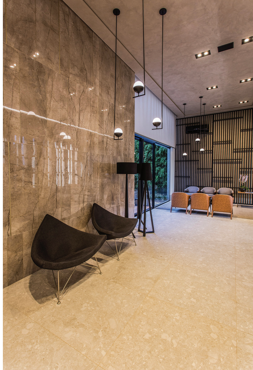
Figure 6 and 7: Details of the reception, designed with layout flexibility and composed of contemporary furniture.