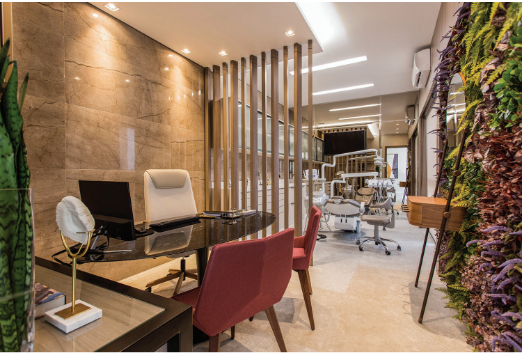
Figure 8: Care room and procedures of one of the dentists and owner of the clinic.