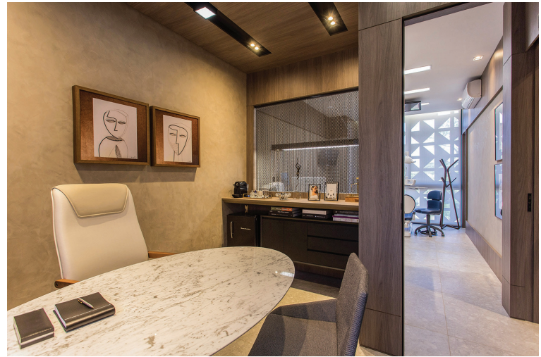
Figure 9: Featured, care room and, in the background, procedure room of one of the dentists and owner of the clinic.