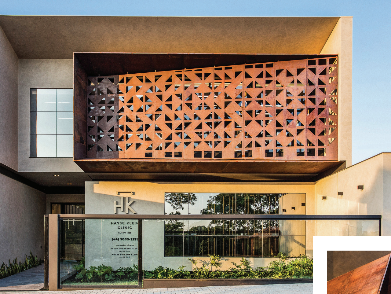
Figure 1: Main façade, enhancing natural lighting and ventilation through the large glass panels.